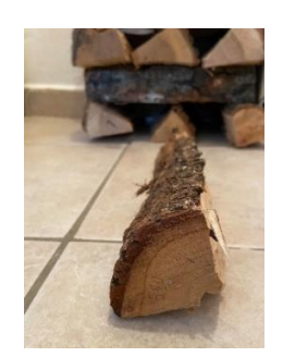
Figure 1. The shape of a dried log

For the oak shape, a quarter of the fine log was selected, which has a triangular shape (Figure 1). Such a form is suitable for home heating which is the most useful. Two sides were without bark but one side with bark. Such a shape was obtained by splitting logs by a splitting machine into four logs splitted twice into 8 logs.