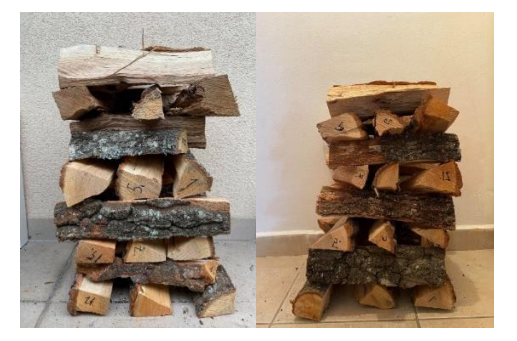
Figure 2. Crossing method of log drying outside and inside

The logs were dried in two places in the winter (in the outdoor environment and in the building). The outer logs were folded crosswise on the tiles and were covered with a roof (Figure 2, left). There was no rain or snow on the logs. It was positive for drying that it was located on the sunny side of the house (south) and that the wind always blew in this place. In such a position the logs should be well dried. The logs stacked in the building were on the tiles, in a part of the house in front of the room with the boiler (Figure 2, right). In such an environment, there was no draft, but the wood was warm which would affect faster drying. Each log was marked with numbers from 1 to 24.