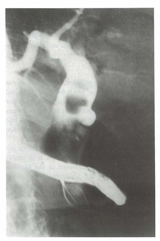
Figure 1. ERC showing a gallstone in the common bile duct.

All stones were fragmented successfully in 14 of the 16 patients. Fragmentation required one session in 12 patients, two sessions in one patient, four sessions in one patient. After ESWL, the stone fragments passed spontaneously in nine patients. In five patients the fragmented stones were removed by basket extraction through the endoscopic sphincterotomy. In two patients ESWL fragmentation failed and impacted stones in the pappila Vateri had to