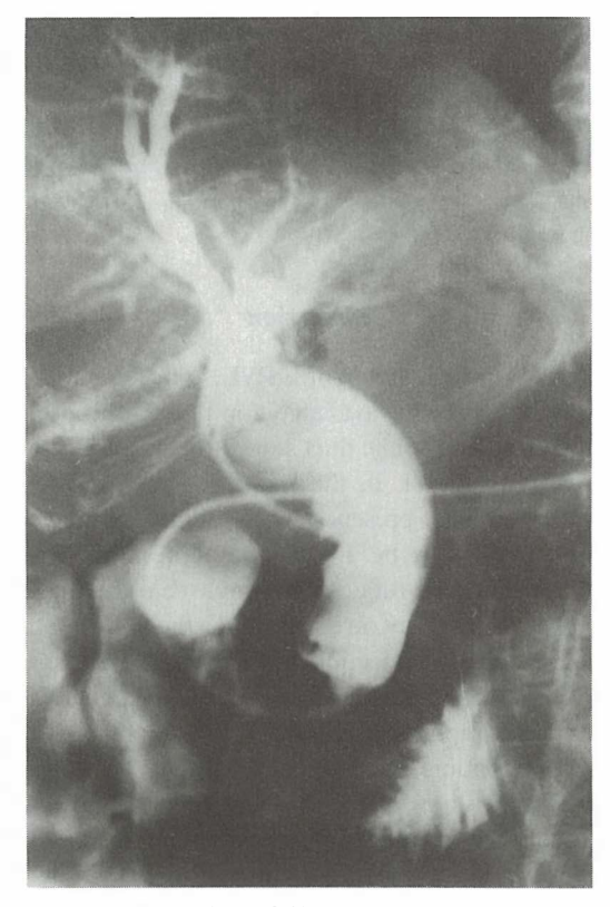
Figure 2. ERC after ESWL and spontaneous passage of fragments.