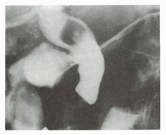
Figure 3. ERC showing a huge gallstone in the common bile duct.

be removed surgicaly. The patients remained in the hospital from 2 to 14 days after the procedure, depending mainly on whether additional intervention was required. No clinically significant adverse reactions could be observed; in particular no evidence of pancreatitis was present. In two patients, transitory hemobilia developed. One patient had transient hematuria. Short – term elevations of LDS and AST were observed in most of the patients. Bruising of the skin was seen in four patients, but none had significant pain (Figure 1–4).