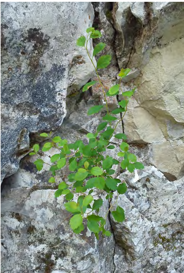
Fig. 9: New locality of Spiraea decumbens near Kozja Peč on the right bank of the Nadiža River.