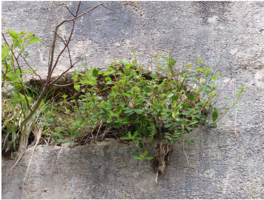
Fig. 8: Secondary locality of Spiraea decumbens in the crevices on the uppermost concrete torrential barrier in the channel of a torrential tributary of the Bela.