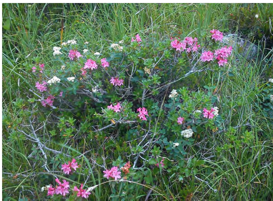
Fig. 7: Spiraea decumbens and Rhododendron hirsutum flourishing on overgrown scree in the stand of the association Spiraeo decumbentis-Seslerietum calcariae .