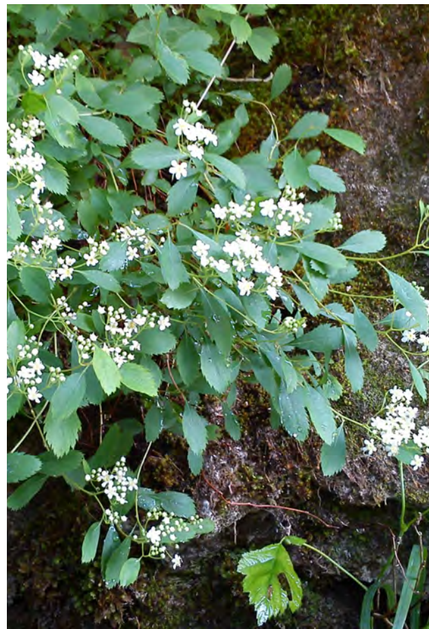
Fig. 10: The second new locality of Spiraea decumbens near Kozja Peč on the right bank of the Nadiža.