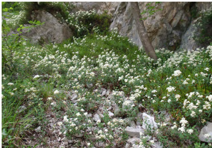
Fig. 6: Stand of the provisional association Aquilegio einseleanae-Spiraeetum decumbentis .