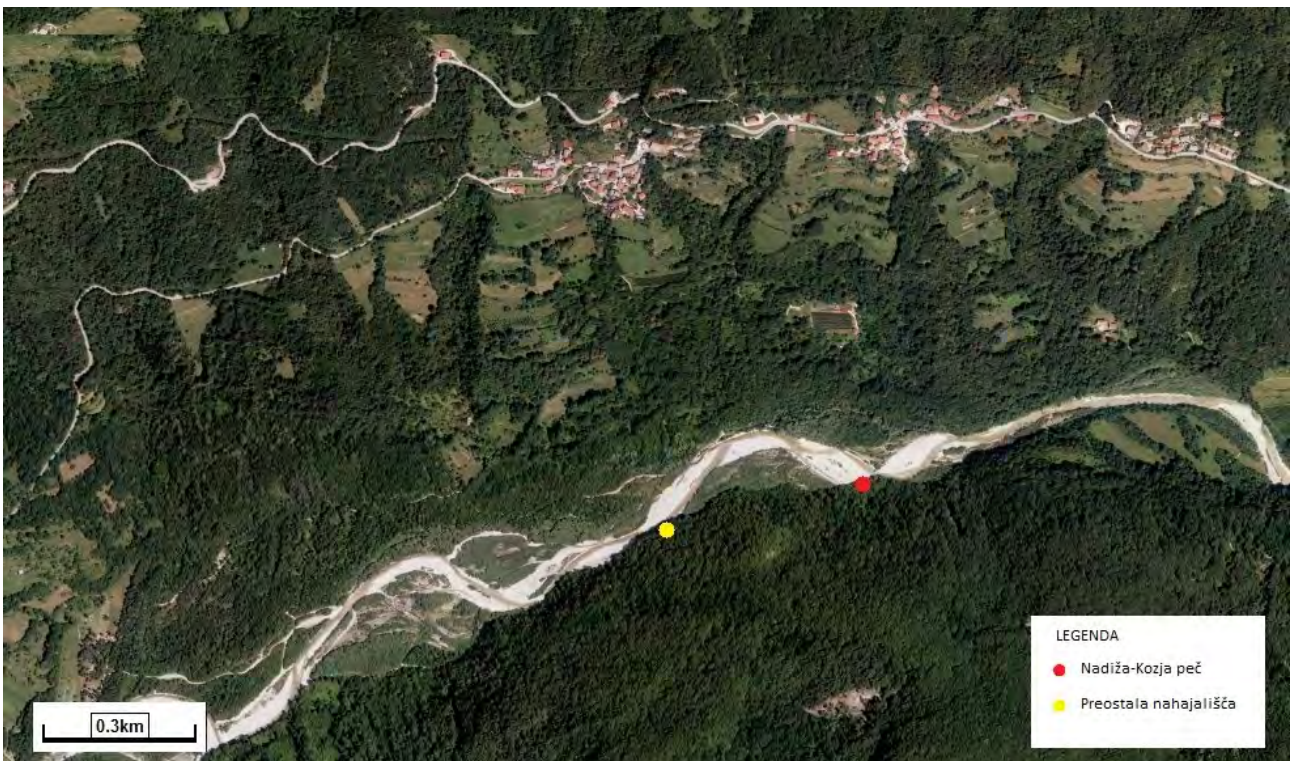
Fig. 2: Localities of Spiraea decumbens under Mt. Mija (Kozja Peč)

overgrowing of screes began after 1933 when concrete torrential barriers were built there. This reduced flow velocity and prevented transportation of gravel. During the construction of barriers on the Bela, a large area was reforested, mainly with the conifers Picea abies , Pinus nigra , Pinus sylvestris , Larix decidua (Kočar, 1999). In this area, Spiraea decumbens grows between the last and its preceding barrier at the elevation between 695 m and 820 m. Nine relevés were made there. The geological bedrock is talus or dolomite rock. Spiraea decumbens grows in two basic vegetation types, in stony grassland on overgrown scree ( Spiraeo decumbentis-Seslerietum calcariae ) and in a chasmophytic community ( Spiraeo decumbentis-Potentilletum caulescentis ). Especially interesting is the secondary locality in the crevices on the uppermost concrete torrential barrier. Researchers have not reported such secondary localities for Slovenia until now, or they have not been known. Wraber (1969) saw them in Pušja Vas (Venzona) in Italy, where Spiraea decumbens grows on