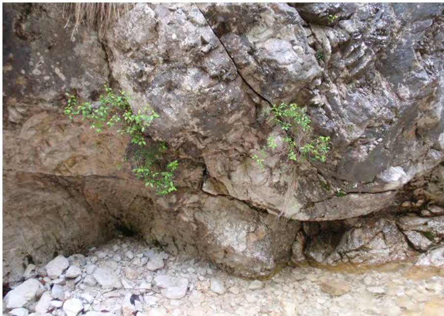
Fig. 5: Stand of the association Spiraeo decumbentis-Potentilletum caulescentis .