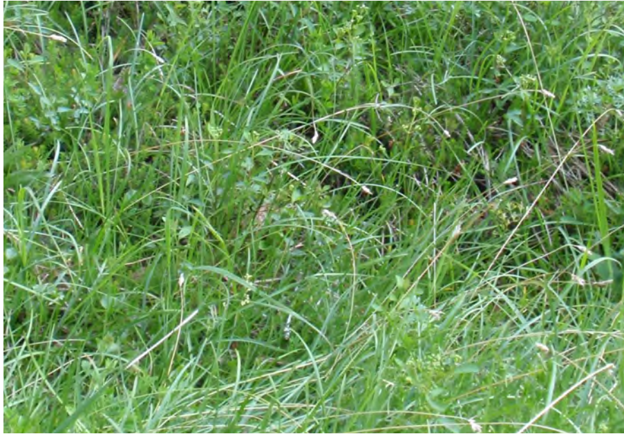
Fig. 4: Stand of the association Spiraeo decumbentis-Seslerietum calcariae .