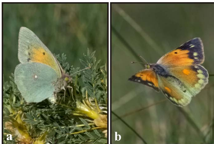
Figure 3. Female ovipositing on Astragalus thracicus (a) and gliding along the slope searching for oviposition spot (b).

Slika 3. Samica pri odlaganju jajčec na Astragalus thracicus (a) in iskanju mesta za odlaganje jajčec (b).