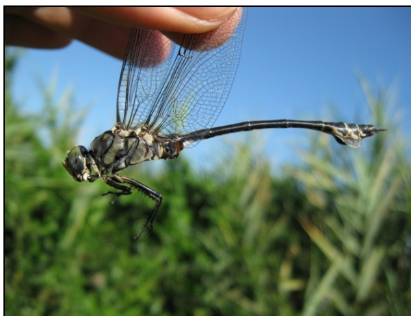
Figure 3. Dark form of Lindenia tetraphylla , caught at the Krupa River (L 11) in Hutovo Blato Nature Park.

Slika 2. Na površju Deranskega jezera (L 10) je bilo opaženih več teritorialnih samcev velike peščenke ( Lindenia tetraphylla ).