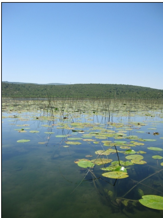
Figure 2. At Deransko Lake (L 10), numerous males of Lindenia tetraphylla were observed while patrolling over the lake surface.

Slika 2. Na površju Deranskega jezera (L 10) je bilo opaženih več teritorialnih samcev velike peščenke ( Lindenia tetraphylla ).