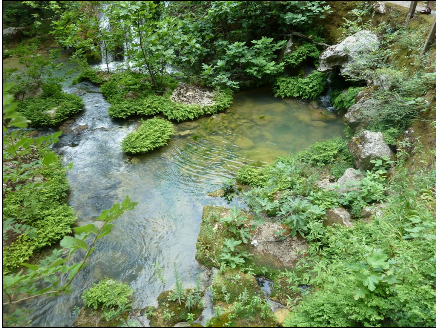
Figure 5. Karst spring of the Tihajina River at Peč Mlini (L 20), where adults and larvae of Callaeschna microstigma , Cordulegaster heros and Cordulegaster bidentata were found.

Slika 5. Ob kraškem izviru na reki Tihajini pri Peč Mlinih (L 20) so bili zabeleženi tako odrasli kot tudi ličinke bledega vetrnjaka ( Callaeschna microstigma ), velikega ( Cordulegaster heros ) in povirnega studenčarja ( C. bidentata ).