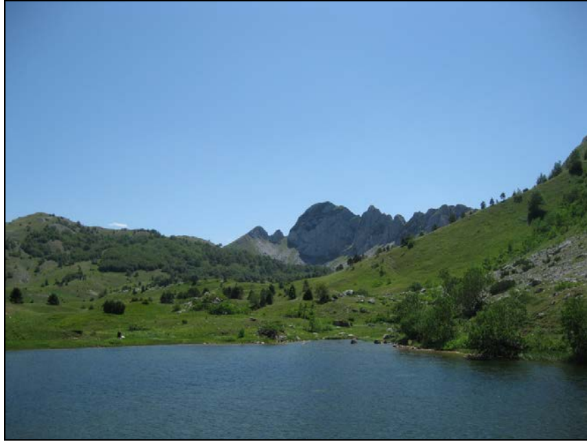
Figure 6. Gornje Bare Lake (L 30) in Sutjeska National Park, the second discovered locality of Somatochlora metallica in Bosnia and Herzegovina.

Slika 6. Jezero Gornje bare v Nacionalnem parku Sutjeska je za Bosno in Hercegovino druga znana lokaliteta kovinskega lesketnika ( Somatochlora metallica ).