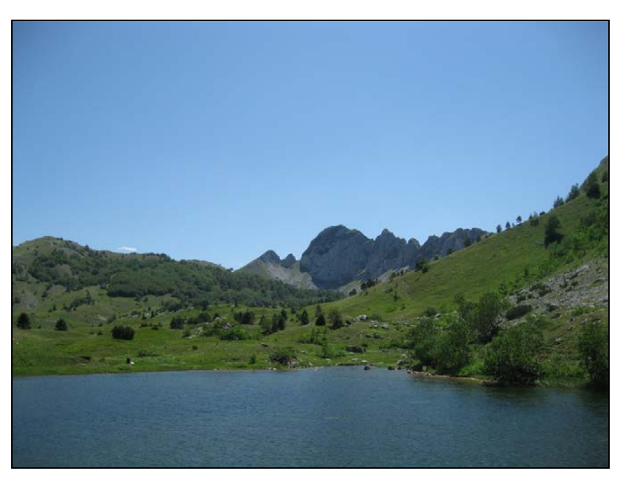
Figure 6. Gornje Bare Lake (L 30) in Sutjeska National Park, the second discovered locality of Somatochlora metallica in Bosnia and Herzegovina (photo: D. Vinko).

Slika 6. Jezero Gornje bare v Nacionalnem parku Sutjeska je za Bosno in Hercegovino druga znana lokaliteta kovinskega lesketnika ( Somatochlora metallica ) (foto: D. Vinko).