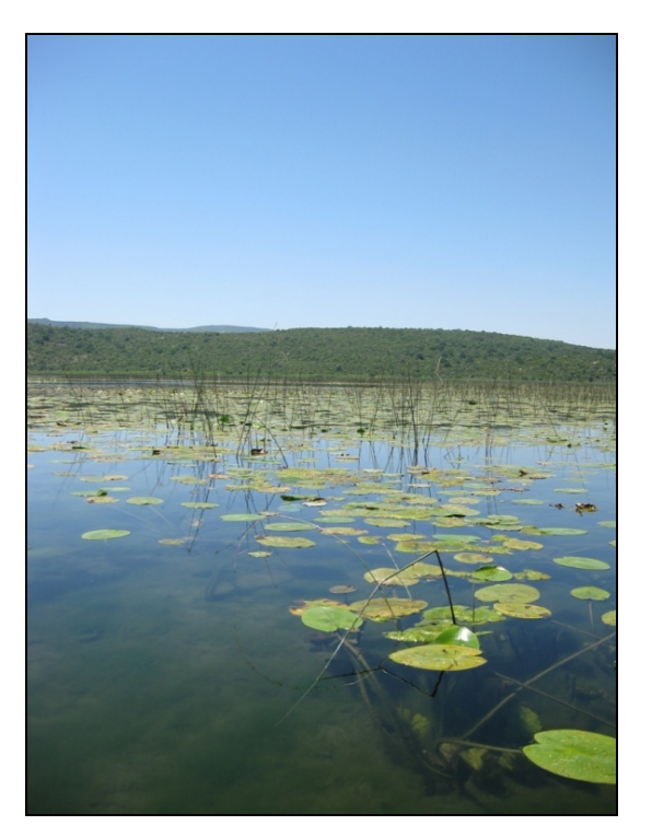
Figure 2. At Deransko Lake (L 10), numerous males of Lindenia tetraphylla were observed while patrolling over the lake surface. Slika 2. Na površju Deranskega jezera (L 10) je bilo opaženih več teritorialnih samcev velike peščenke ( Lindenia tetraphylla ).