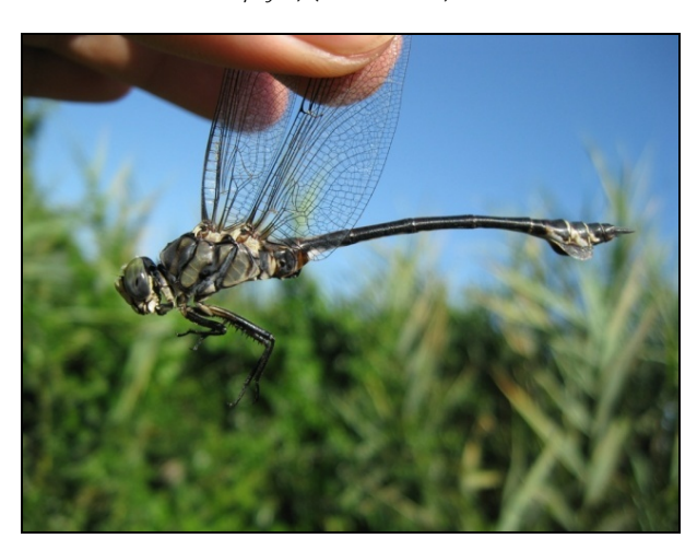
Figure 3. Dark form of Lindenia tetraphylla , caught at the Krupa River (L 11) in Hutovo Blato Nature Park. Slika 3. Temni samec velike peščenke ( Lindenia tetraphylla ), ujet na Krupi (L 11) v Naravnem parku Hutovo blato.