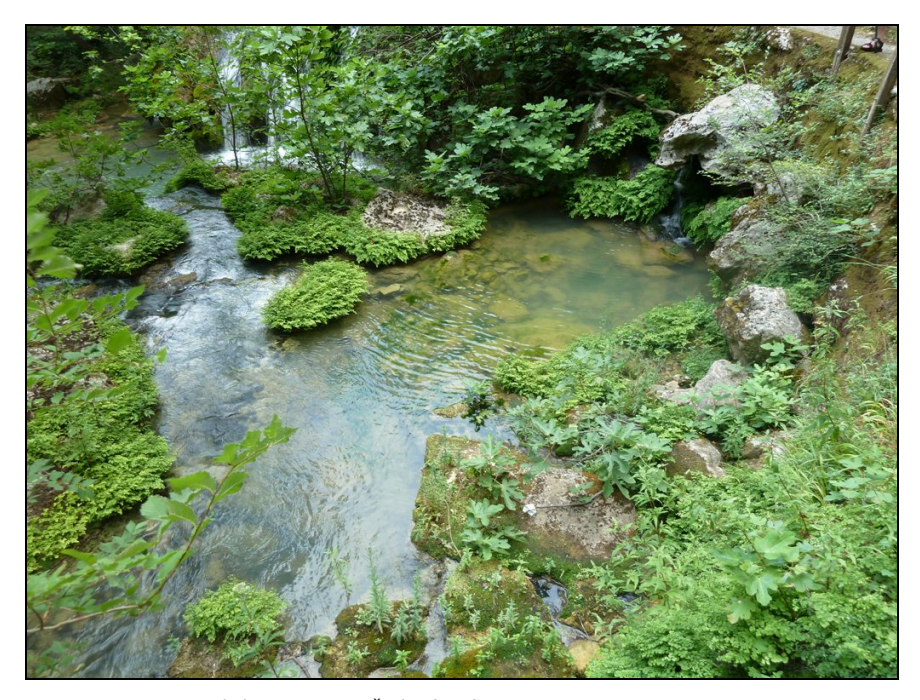
Figure 5. Karst spring of the Tihaljina River at Peč Mlini (L 20), where adults and larvae of Caliaeschna microstigma , Cordulegaster heros and Cordulegaster bidentata were found. Slika 5. Ob kraškem izviru na reki Tihaljini pri Peč Mlinih (L 20) so bili zabeleženi tako odrasli kot tudi ličinke bledega vetrnjaka ( Caliaeschna microstigma ), velikega ( Cordulegaster heros ) in povirnega studenčarja ( C. bidentata ).

The distribution and status of the closely related Somatochlora metallica and S. meridionalis in the country is discussed by Kulijer et al. (2013). Up until our field trip, only one record of a single male S. metallica had been known from Donje Bare Lake, found in 2009 (Kulijer et al. 2013). During our investigation, numerous individuals, tandems and ovipositing females were observed at Donje Bare and Gornje Bare Lakes in Zelengora Mts. This was the second record and a new locality (Fig. 6) of the species for the country, and the first time that a population of the species was observed. On the other hand, although we found it at only one locality (L 4), S. meridionalis is much more common – during recent surveys it has been found at more than 15 new localities (Kulijer 2012, Kulijer et al. 2013, Kulijer unpublished data).