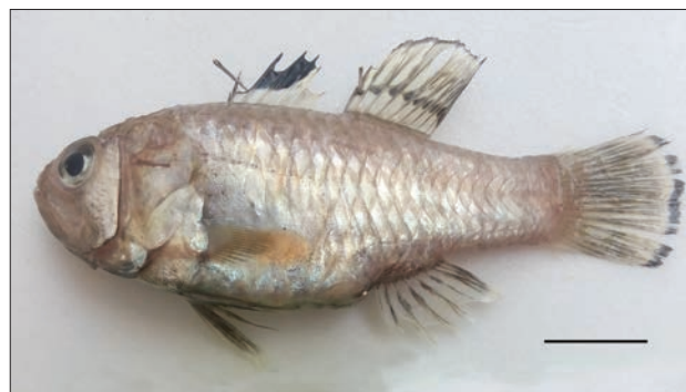
Fig. 2. Specimen of Jaydia smithi (ref. 2329 MSL) collected off Jableh on the Syrian coast, scale bar = 20 mm.

The establishment of exotic species in Syrian marine waters (Ali, 2018; Saad & Khrema, 2023) is partly due to the region's geographic location in the eastern