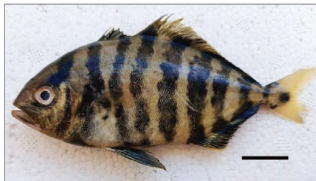
Fig. 3. Specimen of Seriola fasciata (ref. 2330 MSL) collected off Baniyas on the Syrian coast, scale bar = 20 mm.

Sl. 1: Zemljevid sirske obale z označenimi lokalitetami ulova vrste Jaydia smithi . 1. Lattakia (Al-Shawy in sod., 2017). 2. Jableh (ta raziskava). 4. (Ibrahim in sod., 2020); in vrste Seriola fasciata 3. Lattakia (Jawad in sod., 2015), 4. Baniyas (ta raziskava).