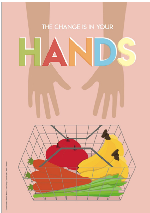
Figure 2: Poster of participating student. DOI: https://doi.org/10.1525/elementa.390.f2

Several other artworks and discussion comments illustrated new values, such as a poster with the title "less is more." One student's artwork depicted the last edition