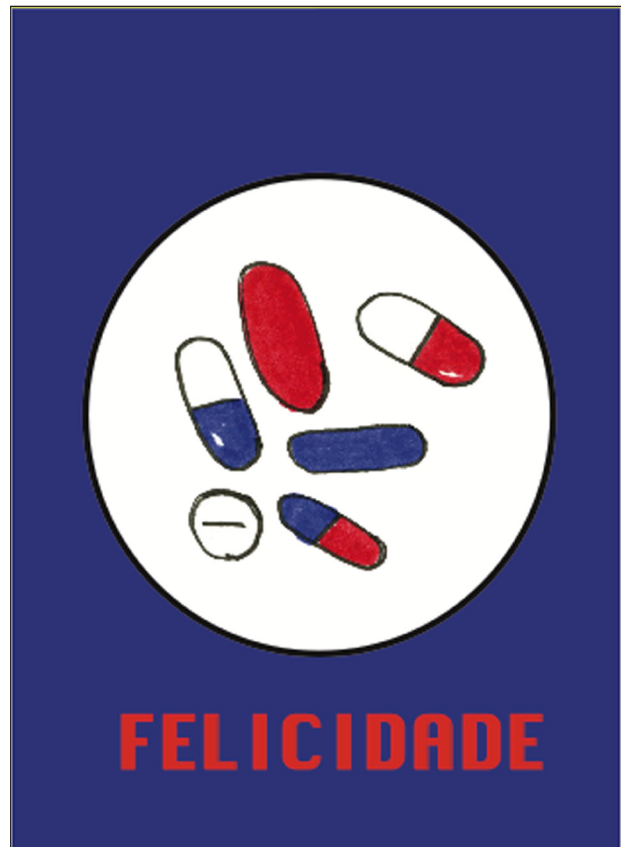
Figure 7: Excerpt from students' brochures. Translation: "Happiness". DOI: https://doi.org/10.1525/elementa.390.f7