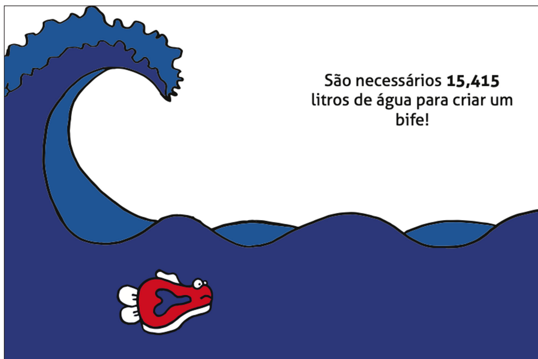
Figure 1: Brochure excerpt illustrating the amount of water necessary to produce one kilogram of beef. DOI: https://doi.org/10.1525/elementa.390.f1

Some students showed increased signs of self-reflection and self-awareness. One student shared that she now feels guilty when she forgets to switch off the lights before leaving home: "it stayed with me" (female student, group discussion, 2018). This new, more conscious relationship with the use of water and electricity is also illustrated in her artwork, making use of a personality named José