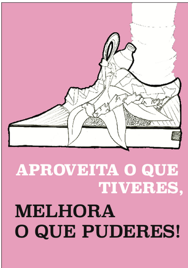
Figure 9: Poster of student. Translation: “Enjoy what you have, do what you can”. DOI: https://doi.org/10.1525/elementa.390.f9