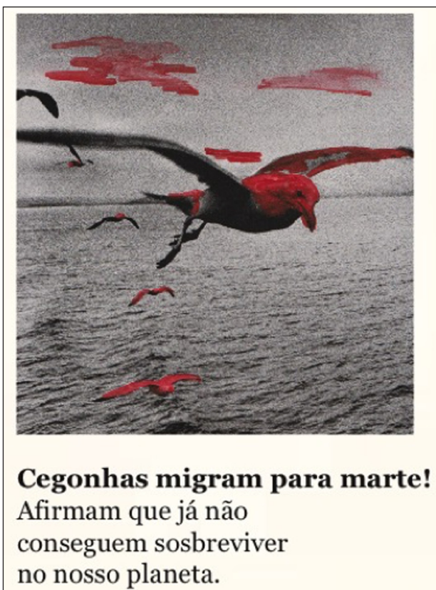
Figure 5: Excerpt from student brochure. Translation: "Storks migrate to Mars. It is confirmed that they can no longer live on our planet". DOI: https://doi.org/10.1525/elementa.390.f5