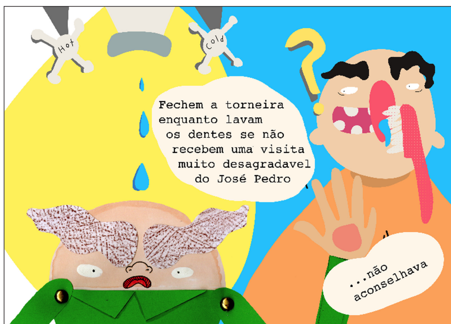
Figure 4: Brochure excerpt of participating student. Translation: "Turn off the tap while brushing your teeth otherwise you'll receive a very unpleasant visit by Jose Pedro... I wouldn't recommend that". DOI: https://doi.org/10.1525/elementa.390.f4