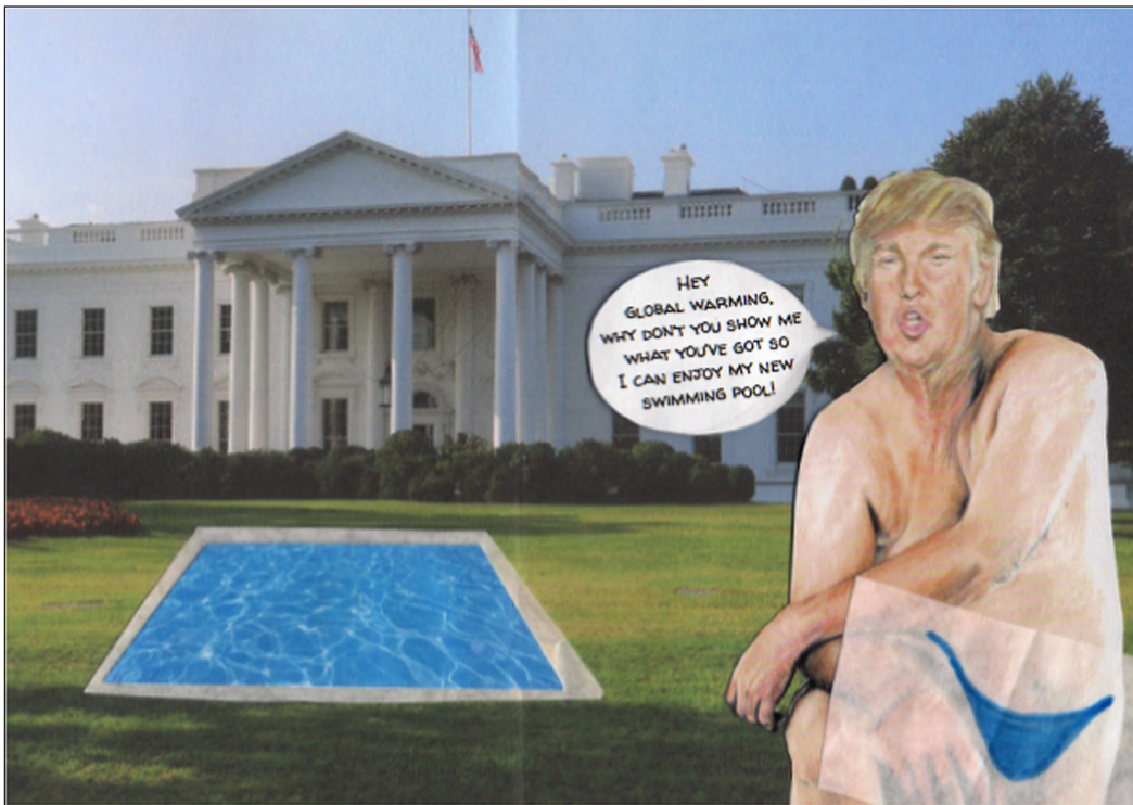
Figure 8: Excerpt from students' brochures. DOI: https://doi.org/10.1525/elementa.390.f8

They suggest that “instead of painting everything rosy, [to] open up for new realities” (male student, group discussion, 2018) by creating awareness about social and ecological challenges at younger ages. Some were even in favor of “shocking people”.