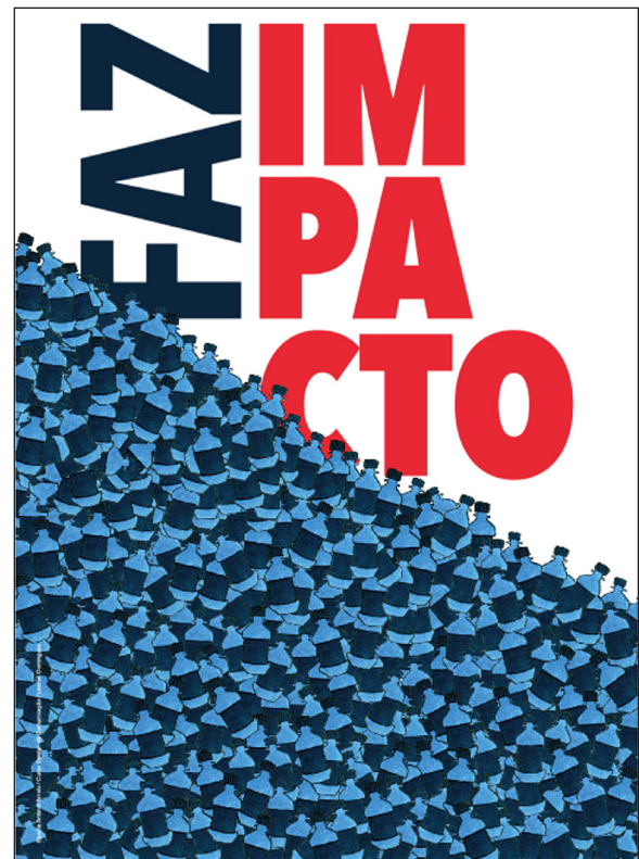
Figure 3: Poster of participating student. Translation: "Makes an impact". DOI: https://doi.org/10.1525/elementa.390.f3