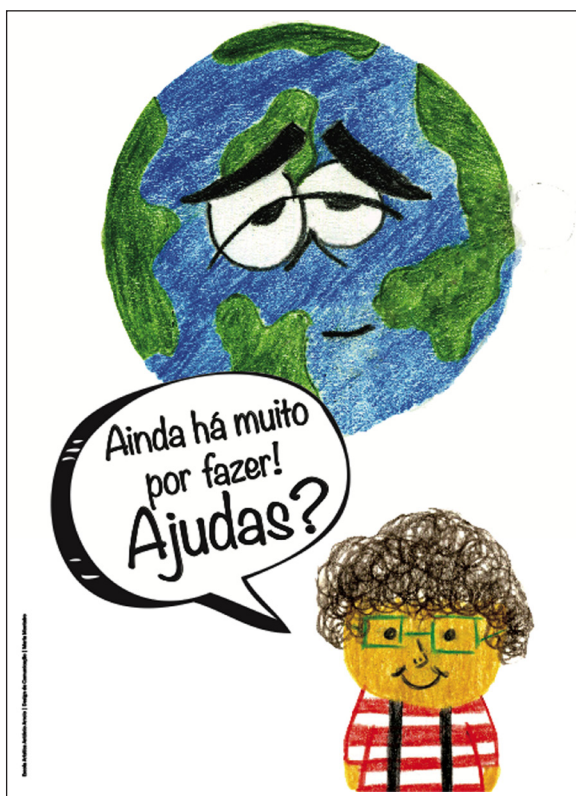
Figure 10: Poster of student. Translation: “There is a lot that needs to be done, do you help?” DOI: https://doi.org/10.1525/elementa.390.f10

“I started to become more aware about my habits, not only my challenge but also the ones that we discussed in the group” (Survey respondent, 2018). Several of the students managed to influence family members or friends by either convincing them to follow their example, or by simply showing them an alternative behavior: