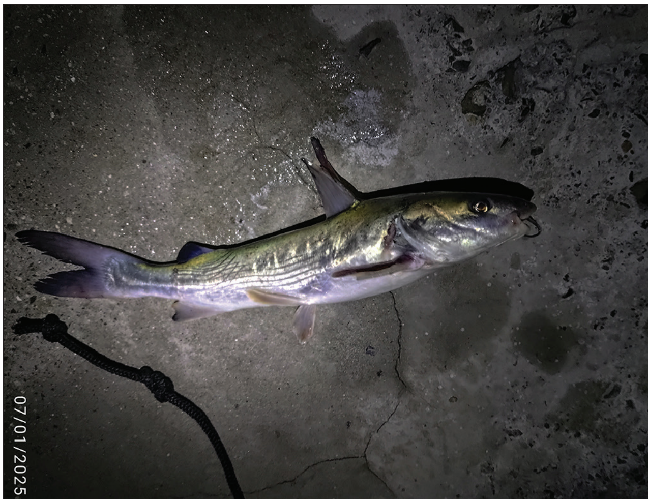
Fig. 2: Ariidae specimen observed in Limassol, Cyprus, on 7 January 2025. Original video footage available at [link] .

Sl. 2: Primerek morskega soma pri Limassolu na Cipru, posnet 7 januarja 2025. Originalni videozapis je razpoložljiv na [link] .