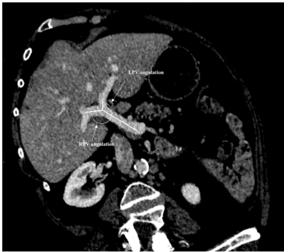
FIGURE 1. Measurements of right portal vein and left portal vein angulation.

RPV = right portal vein, LPV = left portal vein