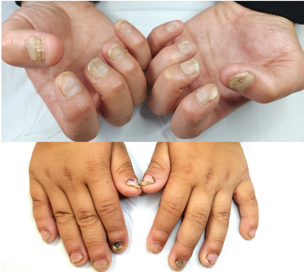
Figure 1 | Top: clinical image of the patient with psoriatic trachyonychia, showing distal onycholysis with an erythematous border on the left index fingernail—a diagnostic feature of nail psoriasis (NP). Bottom: clinical image of the patient with alopecia areata (AA)-related trachyonychia, displaying nail thinning and koilonychia, both characteristic of trachyonychia. Trauma-related features, including subungual and splinter hemorrhages, are also visible. Additionally, cuticle hyperkeratosis, a common feature of trachyonychia, and simultaneous Beau's lines on all nails are noted.