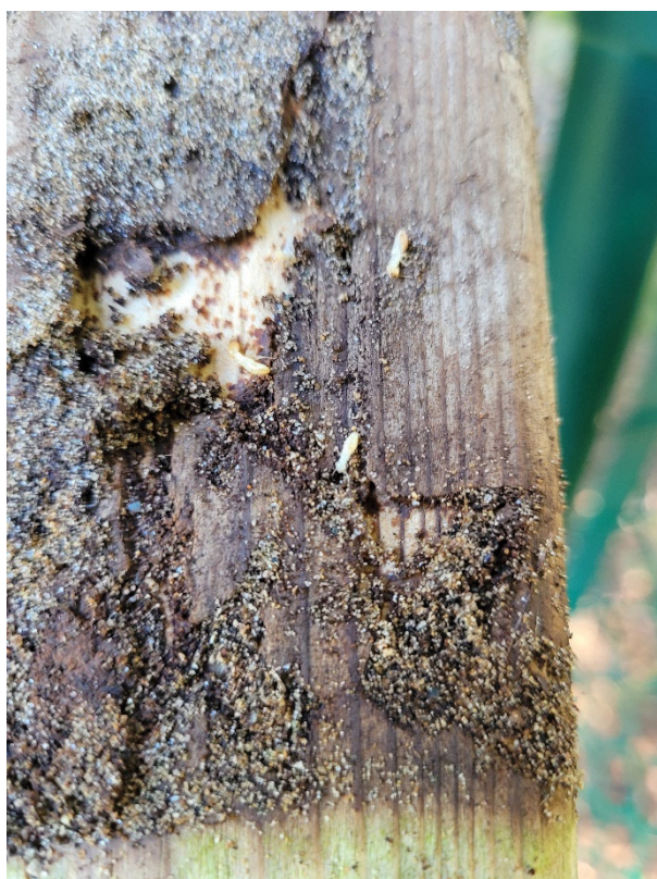
Fig. 4: Termite attack on an untreated red pine post installed in a boot (left) and failure of an untreated red pine post exposed in direct soil contact after 6 years (right)

means that the other measure could no longer be made on that specimen in subsequent years. To minimize the effect of shrinking sample sizes, ratings associated with post footing type and termite attack in untreated controls were compared at selected times when there were few failures. For untreated posts, this was year 1,