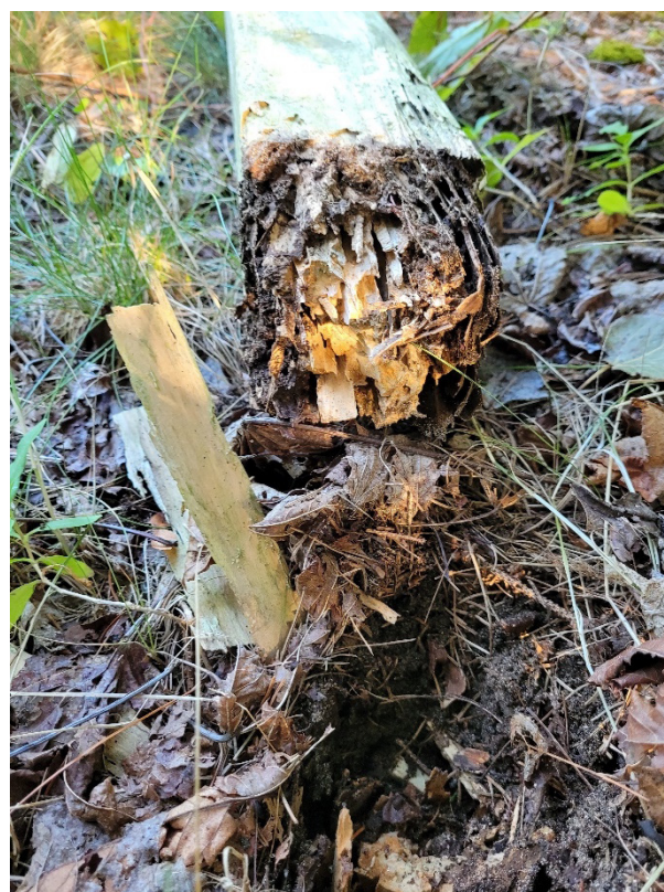
Slika 4: Poškodbe termitov na neobdelanem kolu iz rdečega bora, nameščenim v kovinski čevljev (levo), in poškodba kontrolnega neimpregniranega kola bora v neposrednem stiku s tlemi po šestih letih izpostavitve (desno)