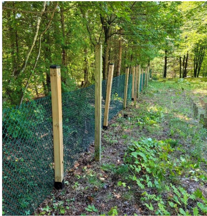
Fig. 1: Test fence installation in Kincardine, Ontario, Canada