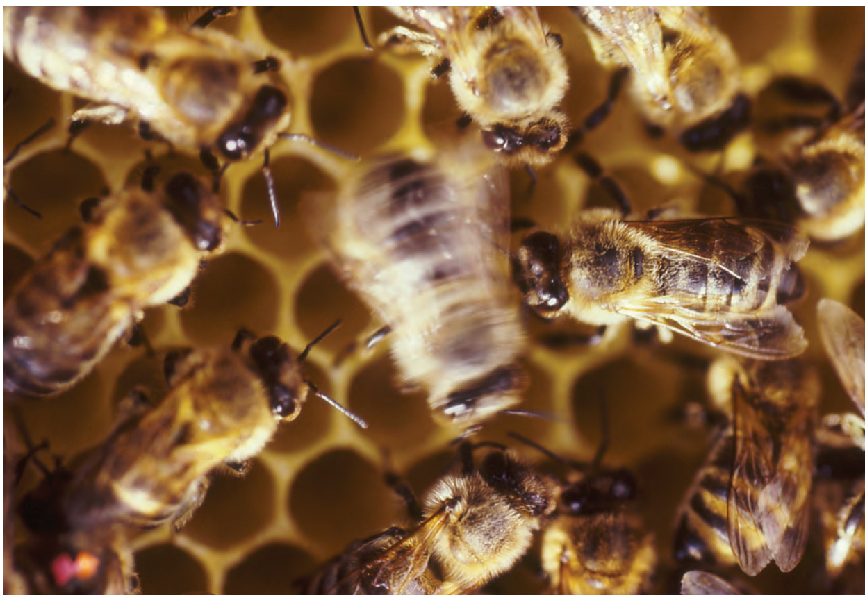
Figure 4: Wagging dancer in the middle with the follower on her left side pushing its antennae into dancer's abdomen.

translated into the angle between the waggle run and vertical direction on the comb in the dark hive (Figure 3). The distance has even simpler correlation, farther is the forage longer is waggle run. Waggle run can be also observed as number of waggles that are performed during the run and even whole dance cycle, waggle run plus return run to start new waggling can be related to the distance of forage (VON FRISCH 1965). It is important to note that return runs are going interchangeable to the left and right side of the direction of waggle run. This stereotype change in path could be important in establishing potential followers that are in the position to pick up dance information (Božič & VALENTINČIČ 1991, Figure 4). Further investigations of details in dance performance revealed some interesting differences between subspecies of Apis mellifera and also between different species of genus Apis . From the focus of this paper I'd like to point out some earlier observations that showed Carniolan bee ( A. mellifera carnica ) as most distant foraging tuned subspecies (VON FRISCH 1965). There has been recognized also the only existing difference between Carniolan bee and