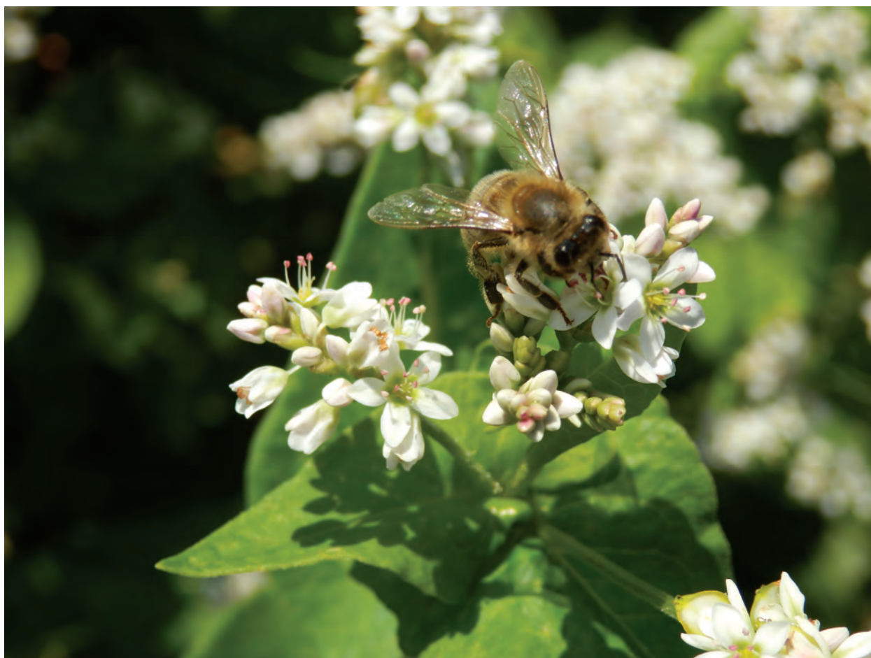
Figure 2: Carniolan bee on the buckwheat flower. Buckwheat was regular and wide spread pasture of late summer for honeybees in time of A. Scopoli and A. Janša. It enabled well developed overwintering colonies with well established honey stores, two important predispositions for good early spring bee colonies development.

tury (GNILSAK 2003; ŠALEHAR & GREGORI 2011). Slovenian beekeepers were not known only because of interesting bees that they managed, but also for good beekeeping practice (GREGORI ET AL. 2003). In 18 th century that was recognized by Austrian court, where Slovenian beekeeper Anton Janša started teaching beekeeping in established beekeeping school. He also wrote a book with details about honey bee colonies reproduction with emphasizes on management of swarming behavior (JANŠA 1771). There he described in detail also matting of queens outside of the hive with multiple drones during several mating flights of young queens before they start laying eggs. That was general knowledge (ŠALEHAR 2015). Even several years earlier was written by Scopoli (Figure 1) in his book Entomologica Carniolica , that queen is mated