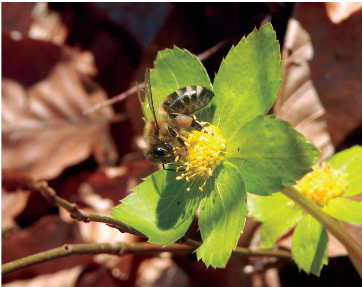
Figure 1: Carniolan bee ( Apis mellifera carnica ) on flowers of Hacquetia epipactis , which is common spring flowering plant in beech forest in Slovenia and some neighboring geographic areas. This plant species from the family of Apiaceae got genus name from Balthasar Hacquet who worked together with Antonio Scopoli in Idria for few years from 1766. This picture symbolize early scientific reports about bees from homeland of Crniolan bee. ( https://www.slovenska-biografija.si/oseba/sbi554298/#slovenski-biografski-leksikon )

tation and learning of bees using observation of dancing bees and their attendance. Modern science is trying to dig into cognitive capability of the bees with the help of dancing behavior (MENZEL & GIURFA 2001; MENZEL 2012; CHITTKA 2017). These developments put under investigation basic questions about dance communication: What are mechanisms of information transfer? What kind of learning is involved and how is that combined with fixed behavior pattern? We will