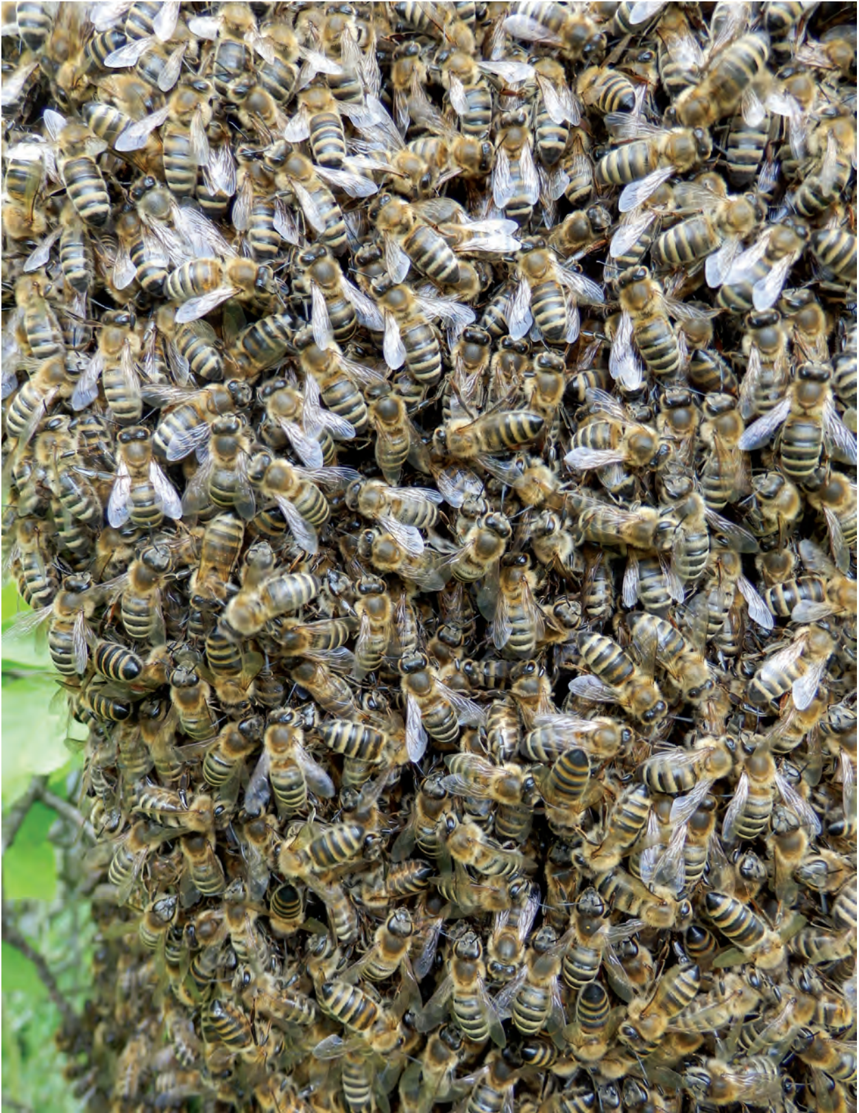
Figure 6: Bees in the swarm, time for collective decision for new home location. Slika 6: Čebele v roju, čas za skupinsko odločitev za novo lokacijo doma