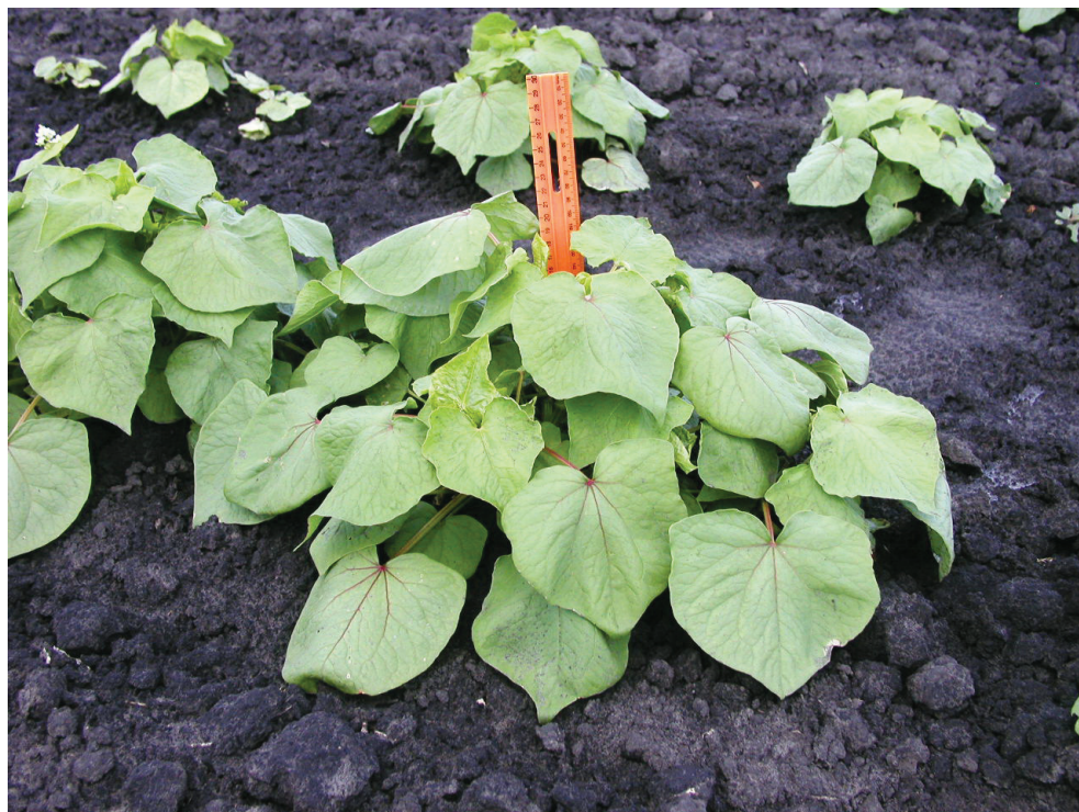
Fig. 6: Early Kiku growth Slika 6: Začetek rasti pri Kiku