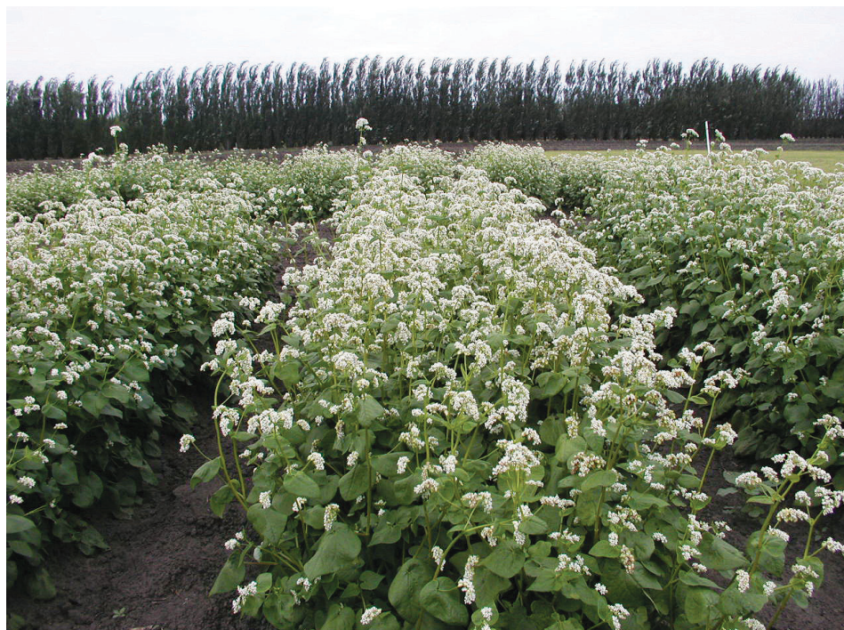
Fig. 3: Plant habit of Kiku types Slika 3: Kiku oblika rastlin