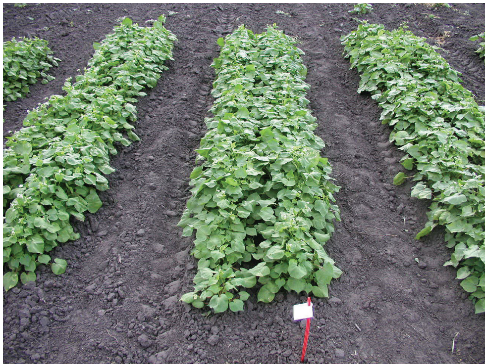
Fig. 7: Early ground cover by Kiku Slika 7: Rastline Kiku hitro pokrijejo tla