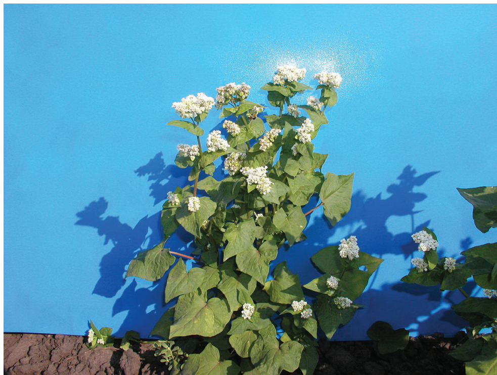
Fig. 16: Plant with ballclusters Slika 16: Rastlina s kroglastimi socvetji