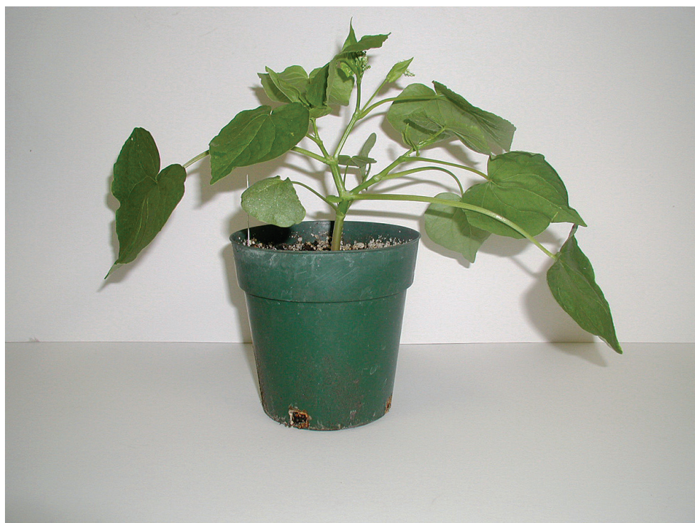
Fig. 8: Plant with early 'weed control' leaves Slika 8: Rastlina z obliko listov, ki zgodaj zasenčijo rast plevelov