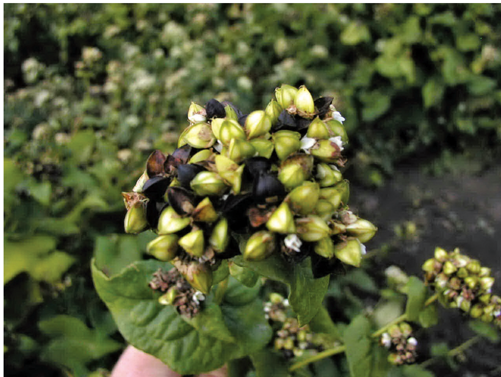
Fig. 15: Ball cluster Slika 15: Kroglasto socvetje