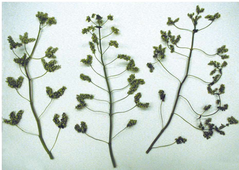
Fig. 13: Differing axillary flower cluster types Slika 13: Različni tipi stranskih socvetij