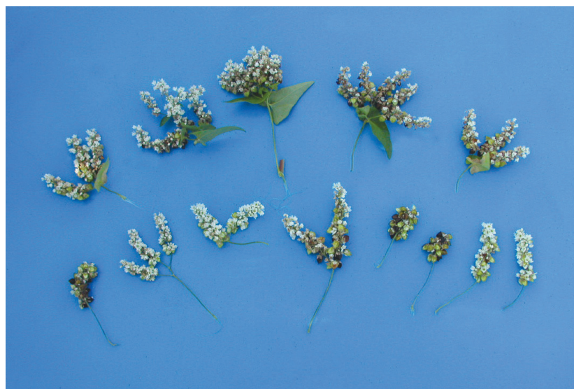
Fig. 10: Flower cluster types that have been found in common buckwheat

Slika 9: Različne stopnje zelenega obarvanja teste