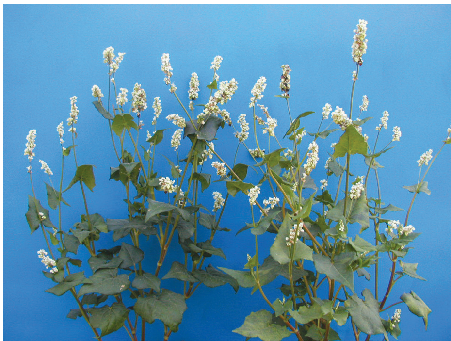
Fig. 14: Determinant flower clusters Slika 14: Socvetja ajde s končno rastjo