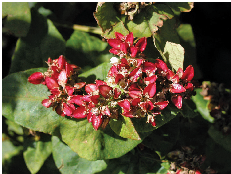
Fig. 17: Red pericarp