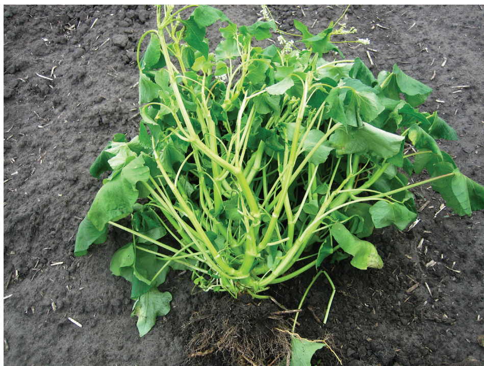
Fig. 4: Kiku branching habit Slika 4: Razvejanje pri rastlinah Kiku