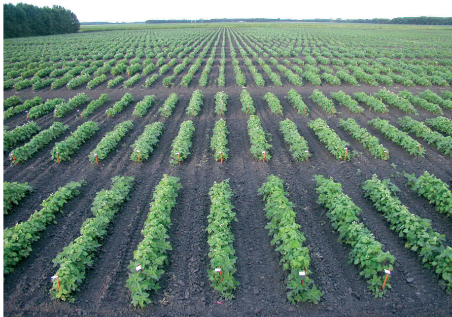
Fig. 1: Field of self pollinating buckwheat Slika 1: Polje s samooplodno ajdo

WANG, Y., CAMPBELL, C. 1998. Interspecific hybridization in buckwheat among Fagopyrum esculentum , F. homotropicum , and F. tataricum . p. 1: 1-13, Proceedings of the 7 th Int. Symposium on Buckwheat, 12-14.