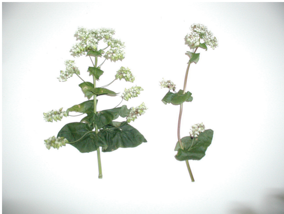
Fig. 11: Enhanced flower clusters Slika 11: Povečano število socvetij