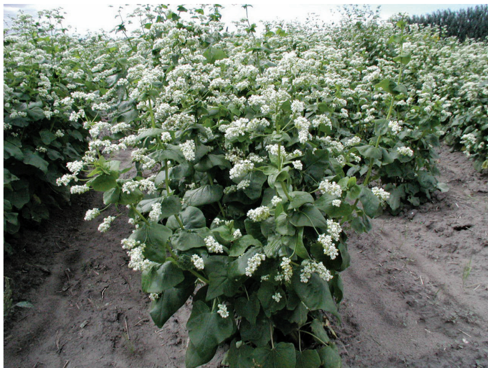
Fig. 12: Enhanced flower cluster plants Slika 12: Rastline z obogatenimi socvetji