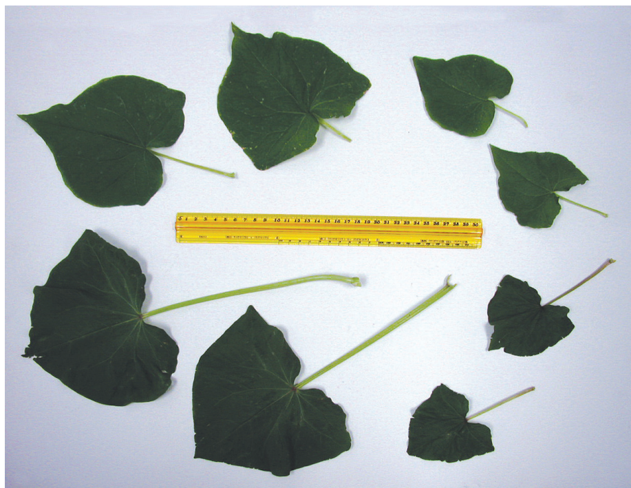
Fig. 2: Leaf sizes Slika 2: Velikosti listov