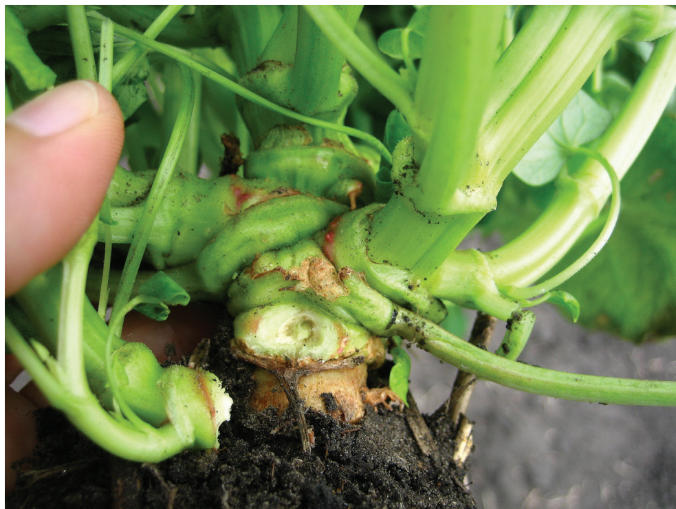
Fig. 5: Kiku has very short internodes at first Slika 5: Na začetku rasti so internodiji zelo kratki