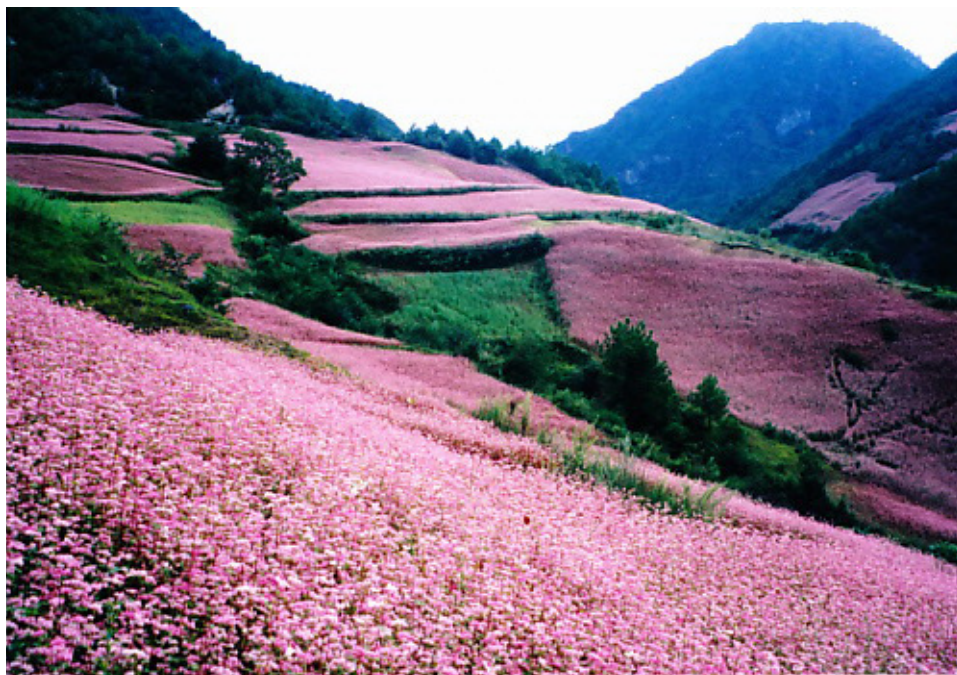
Photo 1: Cultivated common buckwheat in Sanjian area (Weixi district, Yunnan province). Flower color in this area near the original birthplace is beautiful pink.

eastern Tibet in 2002 and 2004, and finally the searches in the Tongyi river valley and the Nyiru river valley in 2004 and 2005 clarified the distribution areas of the wild ancestor of common buckwheat (OHNISHI 2007, see also OHNISHI and TOMIYOSHI, 2005).