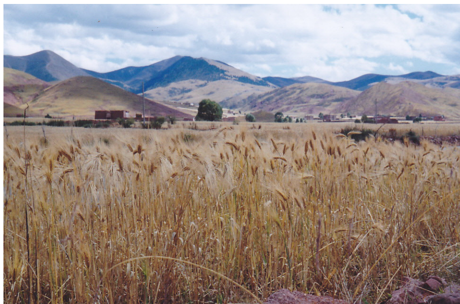
Photo 4: The landscape of northern Mankang district. Although this area is believed to be the original birthplace of common buckwheat, barley is mainly cultivated in cultivation fields.

Now, as a conclusion, we can say that the Yunnan part of the Sanjiang area is not involved in the origin of buckwheat cultivation, rather, Mankang district of the