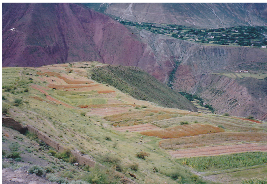
Photo 3: The cultivation of common buckwheat in Yanjing town of southern Mankang district. The brown part of the cultivated field is common buckwheat just before harvest. Yanjing town has a good weather condition for buckwheat cultivation and the wild ancestors of common buckwheat are also growing at the margin of buckwheat fields, although those wild ancestors are not so closely related with cultivated buckwheat.