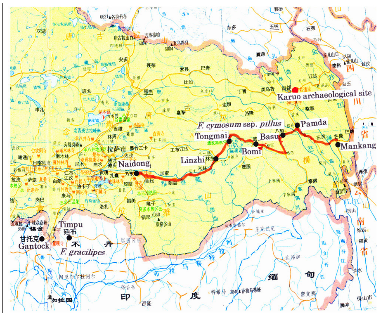
Figure 3. Diffusion route of cultivated buckwheat from Mankang district in the Sanjiang area to India and the Himalayan hills.

It is well-known that F. cymosum growing in the west of the Yaruzampu grand canyon is all tetraploid, and is often called F. dibotris in Nepal and India (see HARA, 1972).