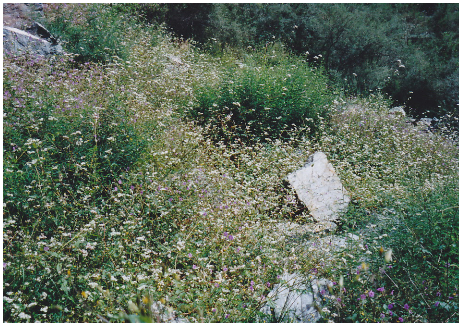
Photo 2: The wild ancestors growing in the Xihe river valley of Mankang district in eastern Tibet. The wild ancestors in this valley are genetically most closely related with cultivated buckwheat. Hence, the Xihe river valley along with the towns in northern Mankang district are considered as the original birthplace of common buckwheat.