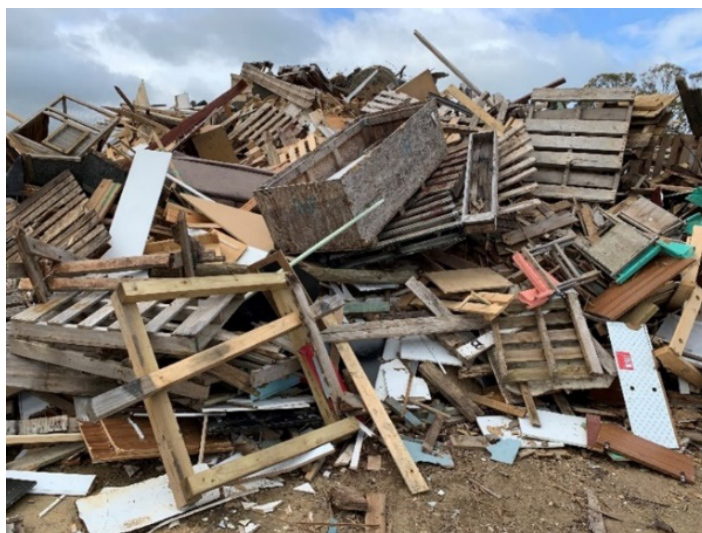
Fig. 1: Mixed end-of-life timber at a resource recovery facility in South Australia.

an approach that could help address climate change while also supporting economic development. As part of this project, a comparison of state-by-state regulations relating to treated timber has been conducted, with key findings presented in Table 5.