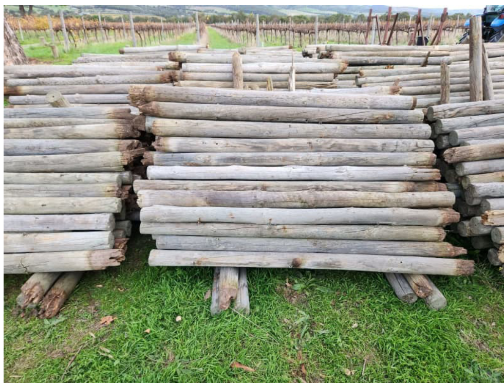
Fig. 1: CCA-treated radiata pine posts stockpiled at an Australian vineyard, awaiting disposal.