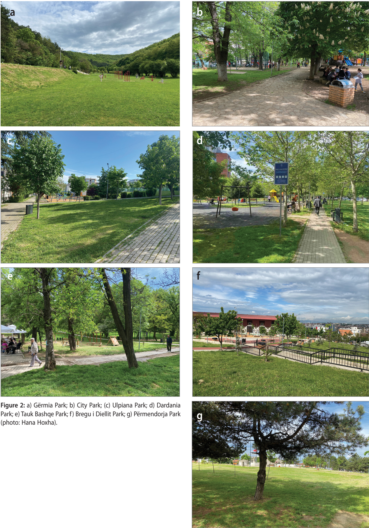
Figure 2: a) Gërmia Park; b) City Park; c) Ulpiana Park; d) Dardania Park; e) Tauk Bashqe Park; f) Bregu i Diellit Park; g) Përmendorja Park.