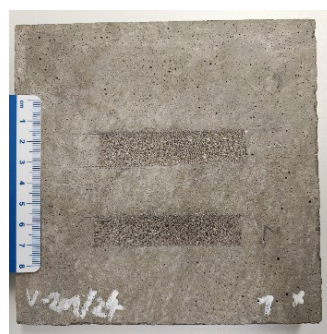
Figure 3: Evaluating freeze-thaw resistance through resonant frequency measurements with a Grindosonic after n-cycles (left); samples after abrasion resistance testing (right).