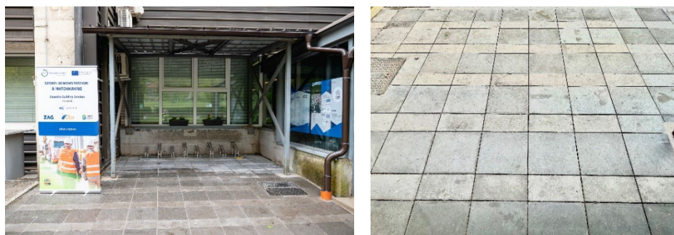
Figure 2: The area paved with GEORIS pavers at SIJ Acroni, Slovenia.