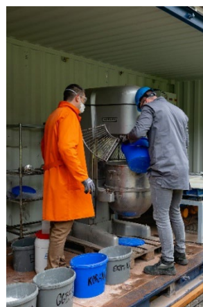
Figure 1: KU Leuven mobile unit for the production of GEORIS pavers