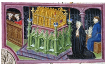
John Lydgate prays at the shrine of St Edmund, from a folio of Lives of SS Edmund and Fremund