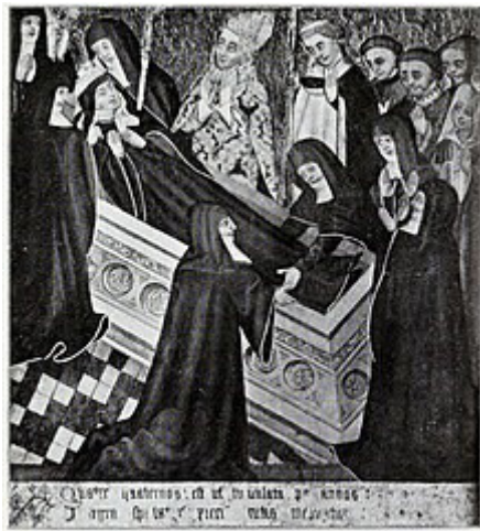
A mediaeval painting of the translation of Æthelthryth at Ely, attended by her sister Seaxburh; https://en.wikipedia.org/wiki/Seaxburh_of_Ely

elevatum de tumulo, et positum in lectulo corpus sacrae Deo virginis quasi dormientis simile; 55 noticing also her clean clothes, another indicator of her spiritual and physical purity: ‘Sed et lintheamina omnia quibus involutum erat corpus, integra apparuerunt, et ita nova, ut ipso die viderentur castis eius membris esse circumdata’ (Ibid., 255). 56