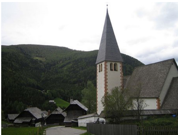
Saint Oswald's church, Bad Kleinkirchheim, Carinthia, one of many churches and place names which commemorate Oswald

To summarise, Oswald underwent an astonishing transition from a defeated king to a European saint. That, however, would have been impossible to accomplish without the active engagement of his energetic family and without their ability to clearly articulate this innovative view of sanctity. The warrior king, having fallen in battle with pagans, is worthy of being elevated to sanctity. In order to enforce this notion, Oswald's family did not hesitate to challenge the spiritual prerogatives of the Church, being highly aware of the spiritual, social and political benefits, which Oswald's saintly status was bringing to both his family and the kingdom.