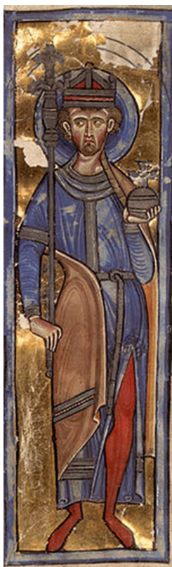
Oswald crowned as a king, from a 13th-century manuscript; https://en.wikipedia.org/wiki/Oswald_of_Northumbria

The earliest account of St Oswald is found in Historia ecclesiastica gentis Anglorum (henceforth HE ) written in 731 by Bede ‘The Venerable’ (673-735), a monk and scholar from the monastery of Jarrow in Northumbria. The facts about Oswald’s life are collected mostly in the third book of HE , while the fourth book provides details about his posthumous miracles and his growing cult in England and abroad at the end of the seventh century. All these details, when interconnected into a meaningful whole, provide the following sequence of events.