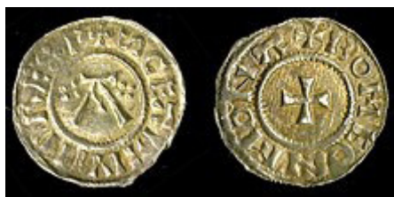
A St Edmund memorial penny