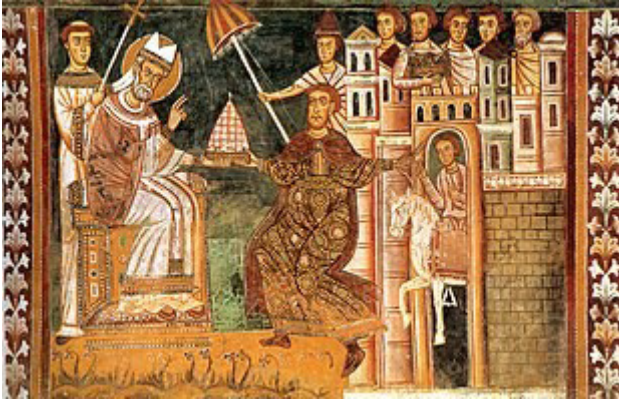
Pope Sylvester I and Emperor Constantine; https://en.wikipedia.org/wiki/Constantine_the_Great

martyrs lived and died in all parts of the Roman empire, the first confessors found shelter in the Egyptian and Syrian deserts. Apart from hermits and monks, confessors also comprised holy women, saintly bishops, abbots, missionaries, and royal women in Gaul and Anglo-Saxon England (Claniczay, 2021, 218-219).