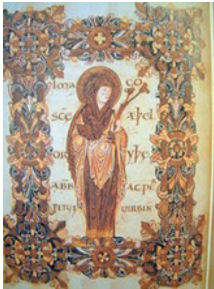
Saint Æthelthryth from Benedictional of St Æthelwold, 10 C

twelve years to persuade Ecgfrith to grant her a divorce and she spent the rest of her life in the monastic sphere. She lived for one year in the double monastery at Coldingham, headed by Ecgfrith's aunt Æbbe, and then moved to East Anglia (673) where she founded a double monastery at Ely. She presided over the community for six years, leading a life of austerity and asceticism. In her forties, 679, she died of plague, being buried at her own wish in the common graveyard.