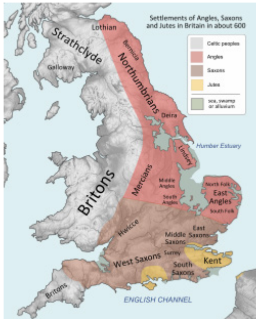
A map showing the general locations of the Anglo-Saxon peoples around the year 600; https://en.wikipedia.org/wiki/Oswald_of_Northumbria , HYPERLINK » https://creativecommons.org/licenses/by-sa/3.0/ « CC BY-SA 3.0 DEED

The Church, thus, elevated to sanctity a restricted number of royal men and women who vitally contributed to the development of Christi-