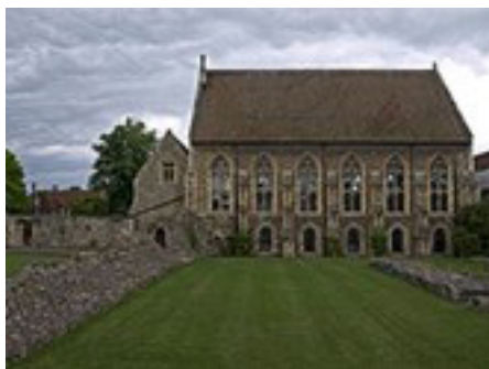
St Augustine's College chapel; https://en.wikipedia.org/wiki/St_Augustine%27s_Abbey HYPERLINK » https://creativecommons.org/licenses/by-sa/3.0/ « CC BY-SA 4.0 DEED