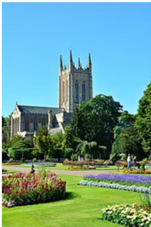
St Edmundsbury Cathedral

The implication is that in the era of secular priests the access to the saint's bodily remains was easier and less restrictive, as suggested by a story about a pious woman named Oswyn who each year trimmed Edmund's hair and pared his nails; these offcuts were treated as valuable relics. 99 Benedictines, by contrast, made Edmund's shrine less accessible (Gourlay, 2017, 83-84) and monastic chronicles mention drastic punishments befalling those who dared to approach the corpse without permission or to treat it improperly. The monks had excellent grounds