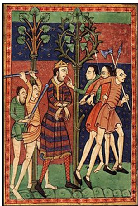
A 12th-century depiction of Edmund's martyrdom (Morgan Library & Museum, New York); https://en.wikipedia.org/wiki/Edmund_the_Martyr