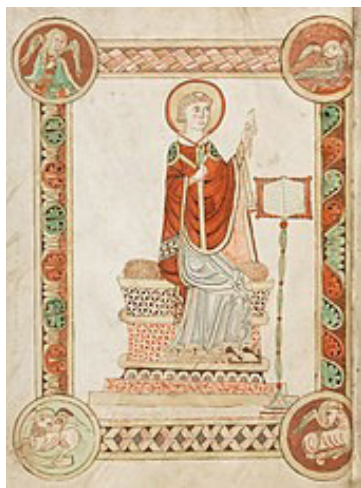
The Venerable Bede writing the Ecclesiastical History of the English People, from a 12th-century codex at Engelberg Abbey, Switzerland; https://en.wikipedia.org/wiki/Bede