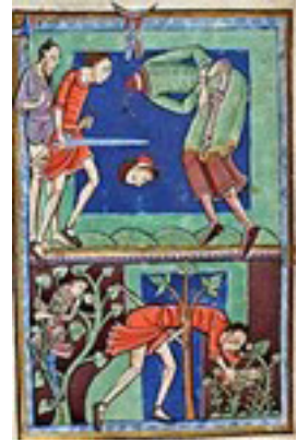
The martyrdom of Edmund: Folios 14r and 14v from the 12th century Passio Sancto Eadmundi (Morgan Library & Museum, New York); https://en.wikipedia.org/wiki/Edmund_the_Martyr

However, the model of a martyr king substituting active warfare with patient suffering at the hands of his enemies (Faulkner, 2012) (Rowsell, 2021) must have been ambiguous. That the image of St Edmund, such as that initiated by Abbo and further promoted by Ælfric, was not wholeheartedly embraced by posterity is implied by later hagiographic narratives. Even though they retain the traditional image of a martyr king, they tend to redress the balance between military and spiritual aspects of Edmund's sanctity and that is the topic of the Epilogue.