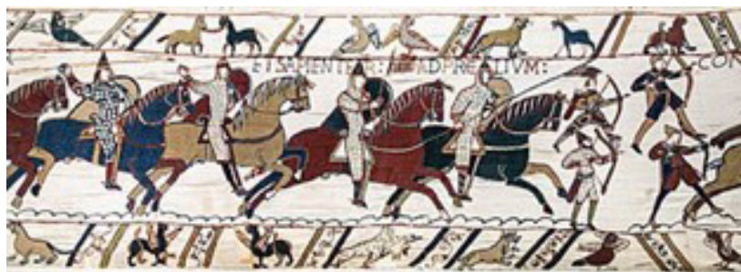
Norman knights and archers at the Battle of Hastings, as depicted in the Bayeux Tapestry; https://en.wikipedia.org/wiki/Battle_of_Hastings