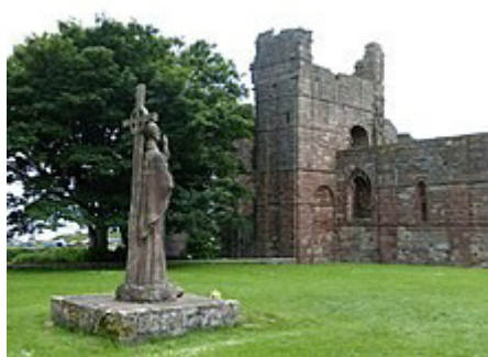
Modern statue of St. Aidan beside the ruins of the medieval priory on Lindisfarne

Historia ecclesiastica also preserves an unforgettable scene highlighting Oswald's generosity. Aidan and Oswald are sitting together at the table at Easter when Oswald learns that a crowd of paupers is waiting in front of the palace. The king orders his servants to take away a large silver bowl full of victuals, crush it into small pieces and divide the fragments as alms. Aidan, deeply moved by this gesture, touches Oswald's right hand and declares that this hand should never rot. The generous king is reminiscent of St Martin of Tours, who cut his military cloak in two to share it with a beggar (Mertens, 2017, 10, 36-37), which is probably one of the most iconic scenes in Western European hagiography.