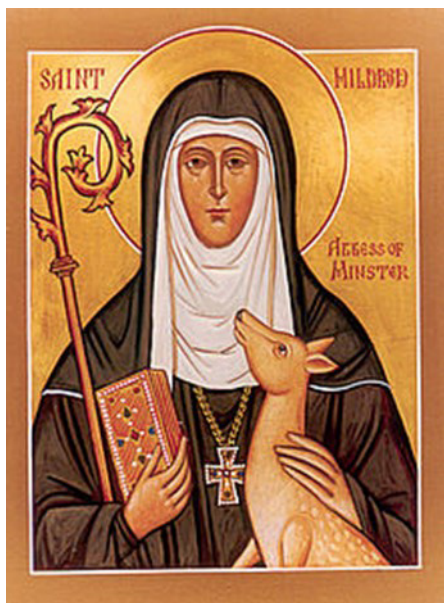
Saint Mildrith; https://en.wikipedia.org/wiki/Mildrith

soon after her translation. 39 The oldest surviving hagiographic accounts, Latin and vernacular, which are likely to be based on the lost older texts, date back to the early eleventh century (Rollason, 1982, 15-40) (Witney, 1984, 20-21).