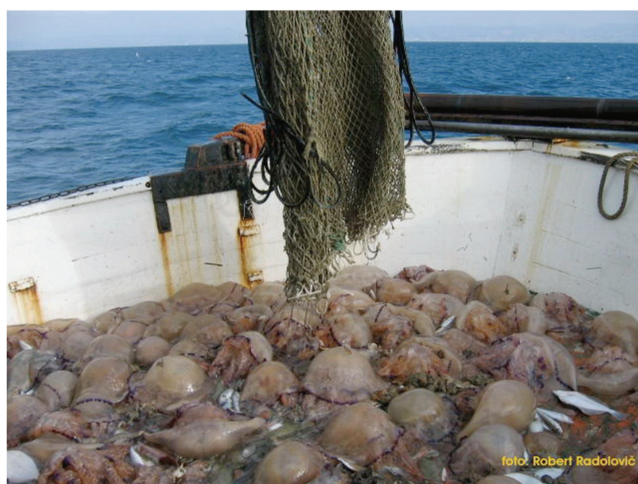
Fig. 2: ‘Fish’ catch in February 2004 in the Gulf of Trieste.

In contrast to long-term qualitative data about the presence of jellyfish in the northern Adriatic, limited quantitative abundance estimates are available. After rather high abundances of barrel jellyfish in 2003, the Piran Marine Biology Station (MBS) started a more systematic survey in 2004. These jellyfish were numerous during cold months, from December to February, decreased from summer 2005 onwards (Table 1), and was < than 10 ind./km 3 in May 2006. Our regular quantitative