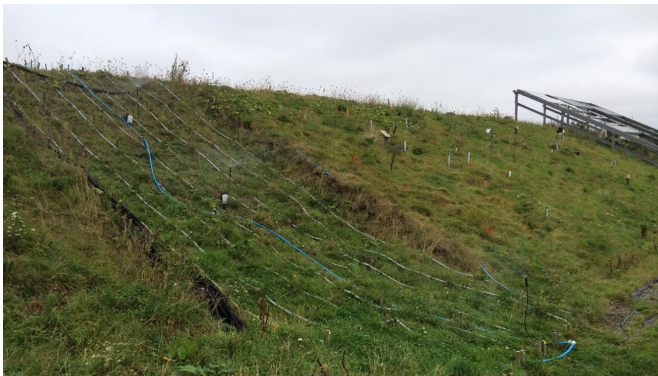
Fig. 1. BIONICS research embankment, Northumberland, UK. The facility has been used to understand earthworks behaviour in relation to climate and test new instrumentation approaches.

mean it is now possible to send significant quantities of data via mobile phone networks. Local wireless data networks that transmit between adjacent monitoring nodes are also becoming commonplace, and are particularly helpful in geographically diverse systems.