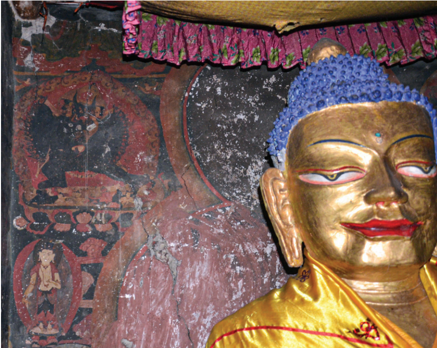
Fig. 10: Vajrabhairava and Vajravelāi to the proper right of the Buddha's head, mural inside the main niche of the Gelugpa White Temple of Hunder in Nubra, India.