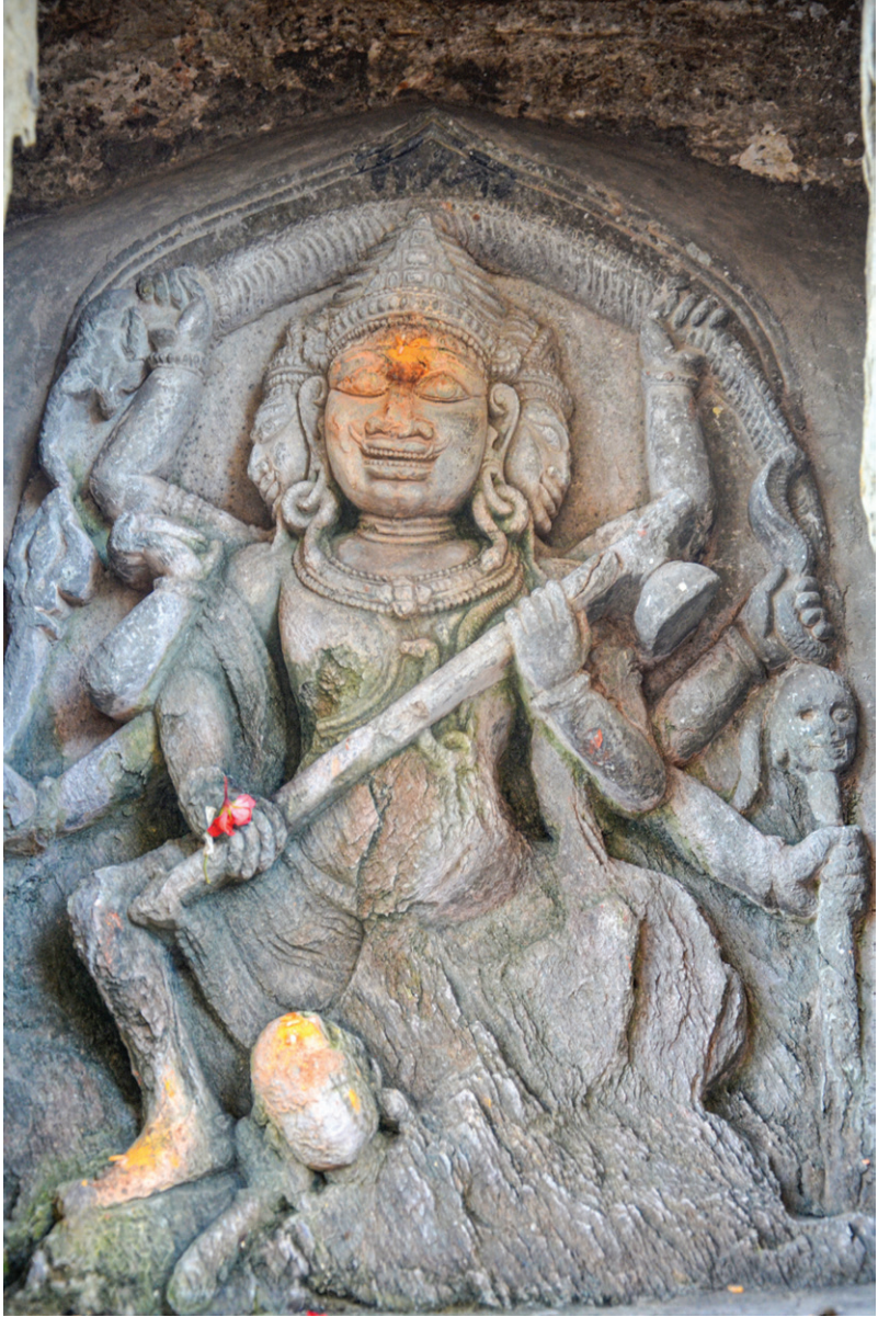
Fig. 8: Bhairava as the terrifying aspect of Śiva, Gaurīśankara Temple, Chamba, India.