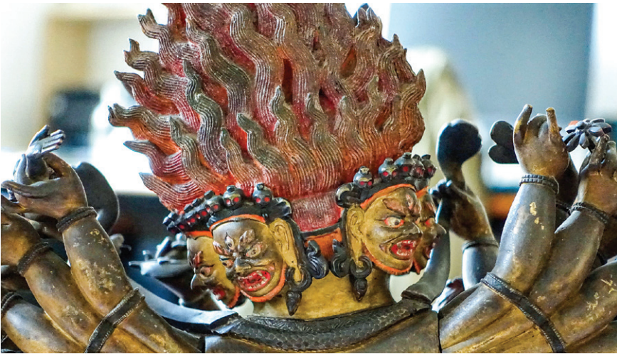
Fig. 5: Rear and lateral heads of Vajrabhairava, Slovene Ethnographic Museum, Ljubljana (inv. no. 216 MG).

Vajrabhairava stands in an active pose with 16 legs on various small figures, while his 17 pairs of arms, holding weapons and attributes (except for the central pair which embraces his female partner), create a radiating aureole. Vajravetāli clings to him with her left leg around his back. Both of her hands are raised while she leans back, looking upwards (Fig. 4). Vajrabhairava is nine-headed. In addition to the three frontally-oriented heads, he has three additional heads on the left and three on the right (Fig. 5). With the exception of the head at the top centre, all heads express extreme wrath, with protruding eyes and exposed fangs. The same applies for the single head of Vajravetāli.