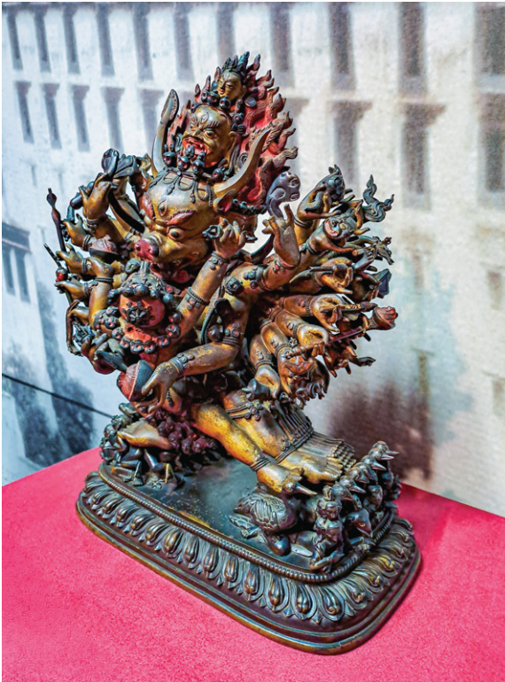
Fig. 3: The wrathful couple. Skušek collection, Slovene Ethnographic Museum, Ljubljana (inv. no. 216 MG).

Vajrabhairava, or Vajramahābhairava (Tib. rdo rje 'jigs byed chen po, Great Lord of Wrath), is also commonly addressed as Yamāntaka, 'the ender of death' (death = Yama). Vajrabhairava is the highest and most potent form of the Yamāntaka group of deities of tantric Buddhism, all of whom share the central buffalo head as a key feature, which is derived from buffalo-headed Yama, the Lord of Death. It is a common practice in esoteric Buddhism, or more traditionally Vajrayāna and Secret Mantrayāna, that an obstacle encountered along the path towards enlightenment is brought down by using the obstacle as a weapon against itself.