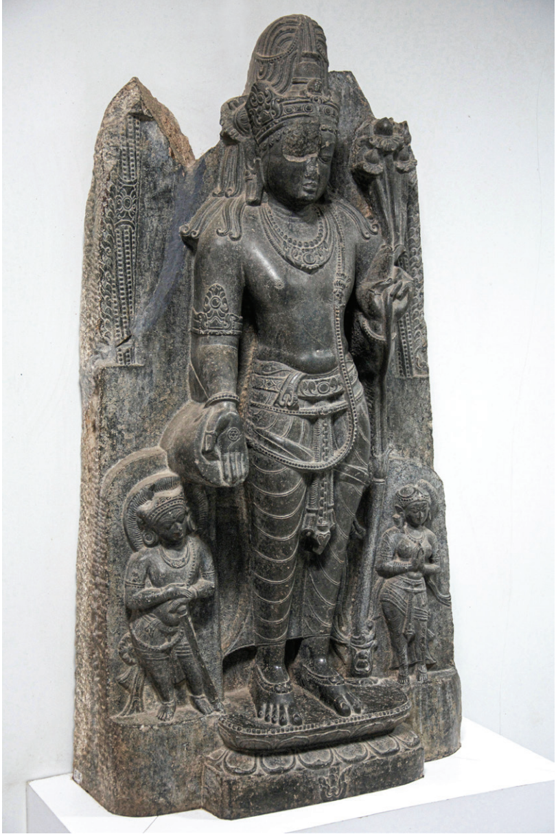
Fig. 7: Stele of Bodhisattva Mañjuśrī with dwarfish Yamāntaka (viewer's left), ASI Site Museum, Bodhgaya, India.