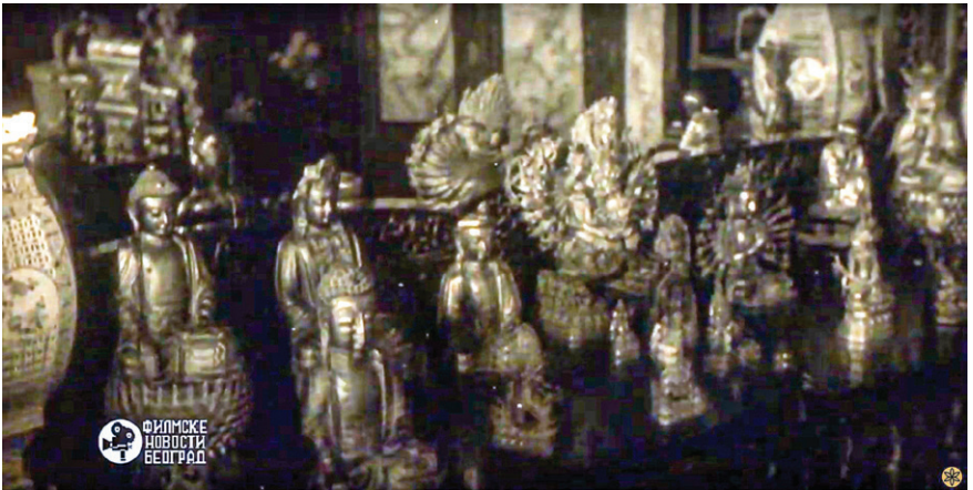
Fig. 2: Still from the 1957 film, Filmske novosti.