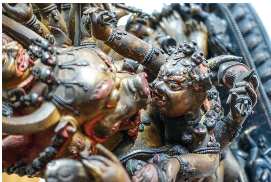
Fig. 4: The wrathful facial expression of Vajravetāli, Slovene Ethnographic Museum, Ljubljana (inv. no. 216 MG).

The iconographical representation of wrathful deities is the standardised method of visualising this concept. In this specific case, the Buddhist response to death is to adopt the same form, absorb and transform, and eventually subdue the obstacle. 2 The addition of the female consort reflects the aspect of wisdom (Skr. prajñā ), which completes and directs the aspect of compassion (Skr. karuṇā ) and skilful means (Skr. upayā ) associated with the male figure. Thereby, this sculpture—just as tantric Buddhist art in general—is a direct reflection of a psychic process.