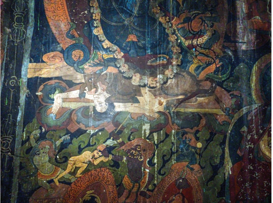
Fig. 13a: Three companions of the Buddhist Yama Dharmarāja—the left one holding two dices, the central one piercing the head of a man, and the right one holding a mirror, Sakya Temple of Skidmang, Upper Ladakh, 16th–17th century.