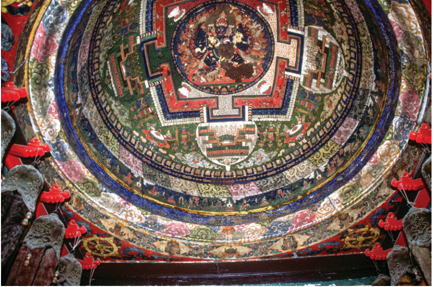
Fig. 11: Mandala of Vajrabhairava in the centre of the dome, Shanyin Dian, Beijing. 24