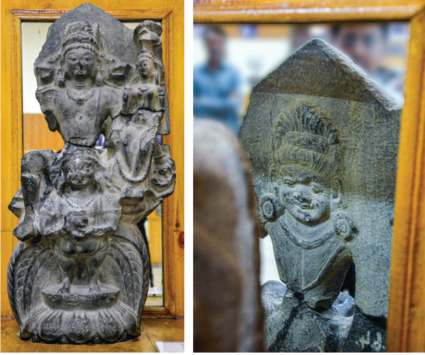
Fig. 6a and b: Four-headed Viṣṇu Vaiṣṇava in front of a mirror, Bhuri Singh Museum, Chamba, India.

the role of the curator of the collection and shaped the stage wherein she began to play a central role, though this was of course never made official. It can be fairly assumed that both the traditional education received by Japanese women as well as the patriarchal system of Slovenia at that time determined that her position remained in the background. 4 In this context, the question arises whether or not the arrangement of the figures resulted from a deliberate creation of a Buddhist house altar. Even if not created as such on purpose, to what extent might the