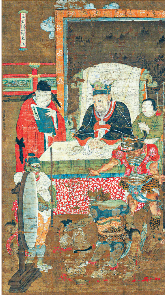
Fig. 14. Yama and mirror, from Lu Xinzhong, Ten Kings of Hell series, 13th century (Southern Song dynasty), China. Nara National Museum, https://commons.wikimedia.org/wiki/File:Ten_Kings_of_Hell,_Yanluo_Wang_(Enra_%C5%8C)_by_Lu_Xinzhong.jpg (CC BY 4.0).