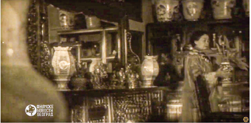
Fig. 1: Still from the 1957 film, Filmske novosti.