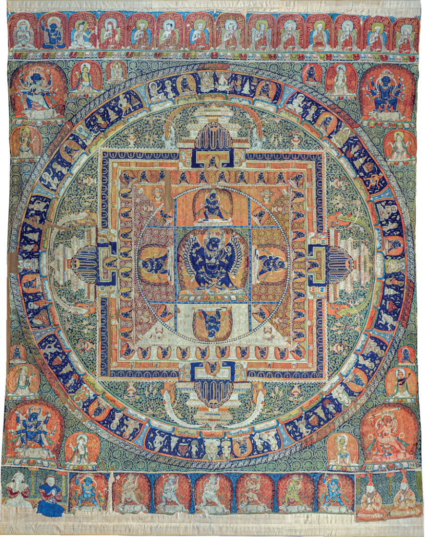
Fig. 9: Vajrabhairava mandala, woven silk tapestry, c. 1330–1332 (Yuan dynasty), Metropolitan Museum of Art, New York, accession no. 1992.54. (public domain), https://www.metmuseum.org/art/collection/search/37614 .