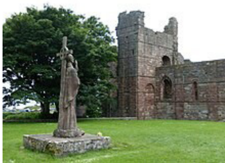
Modern statue of St. Aidan beside the ruins of the medieval priory on Lindisfarne

Historia ecclesiastica also preserves an unforgettable scene highlighting Oswald's generosity. Aidan and Oswald are sitting together at the table at Easter when Oswald learns that a crowd of paupers is waiting in front of the palace. The king orders his servants to take away a large silver bowl full of victuals, crush it into small pieces and divide the fragments as alms. Aidan, deeply moved by this gesture, touches Oswald's right hand and declares that this hand should never rot. The generous king is reminiscent of St Martin of Tours, who cut his military cloak in two to share it with a beggar (Mertens, 2017, 10, 36-37), which is probably one of the most iconic scenes in Western European hagiography.