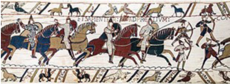
Norman knights and archers at the Battle of Hastings, as depicted in the Bayeux Tapestry; https://en.wikipedia.org/wiki/Battle_of_Hastings