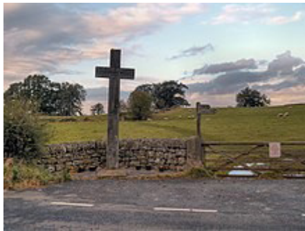
Heavenfield: cross and battlefield; https://en.wikipedia.org/wiki/Battle_of_Heavenfield , HYPERLINK » https://creativecommons.org/licenses/by-sa/3.0/ « CC BY-SA 2.0 DEED

emphasises the numerical superiority of Oswald's enemies at Heavenfield, and in 3.2 the exiled king and his companions are said to have erected a cross on the eve of the Battle of Heavenfield. This scene prompted scholars to draw parallels between Oswald and Emperor Constantine, who before the famous Battle of the Milvian Bridge in 312 had a dream in which he was promised to win in the sign of the Cross (Bintley, 2014, 178-179). In addition, Oswald's victory at Heavenfield can be regarded by medieval standards as a just war, iustum bellum , a concept used by such prominent ecclesiastical authorities as St Augustine of Hippo (354-430) and Bishop Ambrose of Milan († 397) to justify the use of military force by Christians (Hare, 1997, 20-23) (Cross, 1971, 270-273) (Hill, 1980-81, 57-80). Cadwalla is an invader, an outsider who occupies and ravages Northumbria, treating its inhabitants as a defeated race. He is a Christian, but an adherent of Celtic Christianity which Bede rejected as heretical. Oswald's position in the Battle of Heavenfield is crystal clear: he is a defender of his people and, more importantly, his victory over numerically stronger opponents is a sign of divine favour.