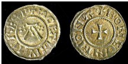
A St Edmund memorial penny