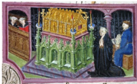
John Lydgate prays at the shrine of St Edmund, from a folio of Lives of SS Edmund and Fremund (British Library)