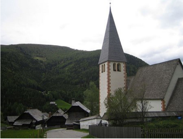
Saint Oswald's church, Bad Kleinkirchheim, Carinthia, one of many churches and place names which commemorate Oswald; https://orthochristian.com/73006.html

To summarise, Oswald underwent an astonishing transition from a defeated king to a European saint. That, however, would have been impossible to accomplish without the active engagement of his energetic family and without their ability to clearly articulate this innovative view of sanctity. The warrior king, having fallen in battle with pagans, is worthy of being elevated to sanctity. In order to enforce this notion, Oswald's family did not hesitate to challenge the spiritual prerogatives of the Church, being highly aware of the spiritual, social and political benefits, which Oswald's saintly status was bringing to both his family and the kingdom.