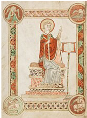
The Venerable Bede writing the Ecclesiastical History of the English People, from a 12th-century codex at Engelberg Abbey, Switzerland; https://en.wikipedia.org/wiki/Bede