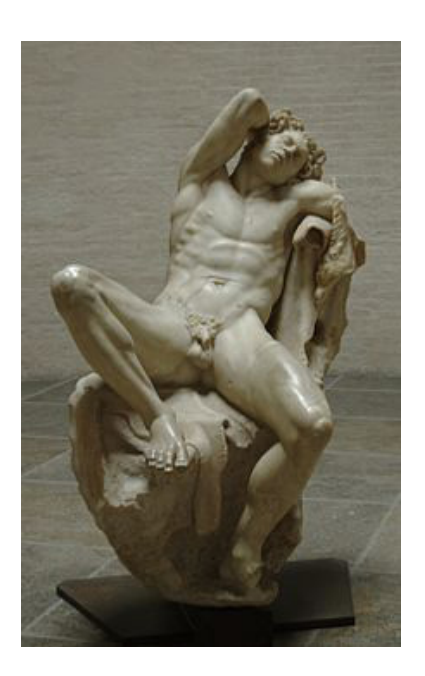
480 Image 7 : Barberini Faun, the drunken satyr, c. 3<sup>rd</sup> or 2<sup>nd</sup> century BC, discovered in Italy in 1620 (Glyptothek, Munich).

The fairy tale of Beauty and the Beast illustrates the light and dark sides of a couple's love, beginning with the pursuit of beauty heeding to the animal forces, the bestiality, barbarism, and inhuman cruelty of power associated with beauty and love. Although Nehamas does signal the dangers of love, its dark side, he ultimately affirms the claim of his title and the notion that beauty is the promise of happiness is preponderant and occupies most of his rhapsodic, highly personal, passionate, and felicitous book.<sup>15</sup> While his Platonic notion of beauty impelled by love is quite compelling, it may be misleading and idealistic to the extent that it means assigning a prominent role to beauty to the expense of ugliness, discordance, irony, and the like, which make art and reality seem infinitely more complex, particularly nowadays (Image 8). Love does transform ugliness into beauty in the eyes of the lover, but ugliness also