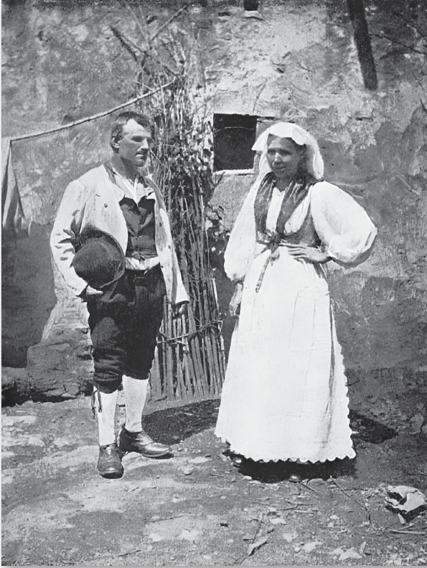
Figure 3: The traditional clothing of the rural population in the Furlan part of Gorizia and Gradisca