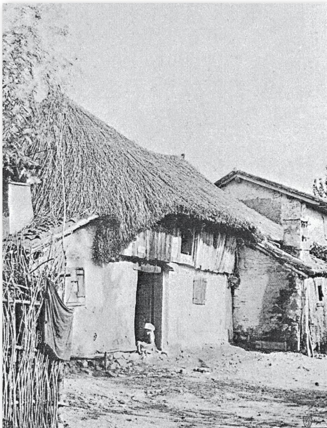
Figure 2: An example of a peasant house in the Friulian part of Gorizia and Gradisca. At the end of the 19 th century, dwellings were often still covered with thatch, without flooring, separate rooms, proper ventilation, heating and access to light.

Source: Giuseppe Caprin, Pianure friulane: seguito ai libri Marine Istriane - Lagune di Grado (Trieste: Stabilimento Artistico G. Caprin, 1892), 249