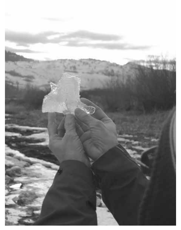
Figure 1: ©E.A. Armstrong

culture and social values tie diverse communities to the ecological whole: the future of which we hold in our hands.