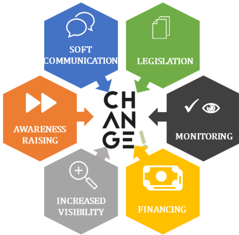
Figure 3: Final version of the road to sustainability that will allow the maintenance of CHANGE activities beyond the project's lifetime.