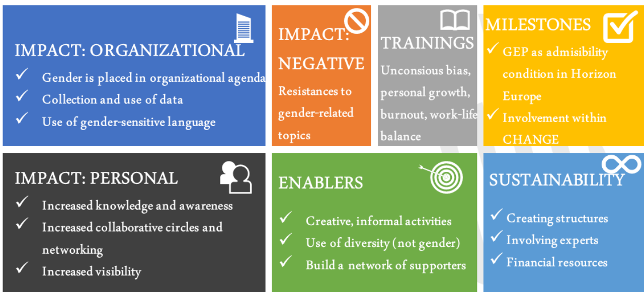
Figure 2: The CHANGE dashboard - illustrating the overall impact (personal and organizational) of involvement in projects such as CHANGE and expectations of CHANGE GEP-implementing partners (UAVR, UNIZA, NIB, IFAM and BBC from Portugal, Slovakia, Slovenia, Germany and Israel, respectively)

PERSONAL IMPACT - POSITIVE. The involvement in projects such as CHANGE, that assess and challenge the existing structure in public organizations has multiple impacts. Important positive impacts on the personal level that were mostly observed by CHANGE partners are the increase of level of baseline knowledge on the topic. In this sense, the project enabled a platform for knowledge co-creation and exchange. Partners who might have been newcomers to the topic at the beginning of the project, are now locally (either in the organization itself or nationally) considered as experts in the field, with proven track of practical experience. Moreover, the project enabled the creation of various networking opportunities, through its meetings, where typically experts (advisory board members and local experts) were invited to join the physical meetings. Through various