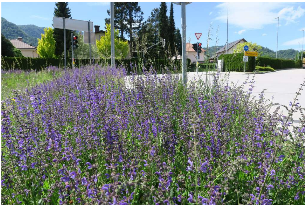
Figure 4: Pollinator Paradise: Flourishing flowering patches in urban Green Infrastructure become vital habitats for pollinators.

The project contributes to solutions and practices that will improve conditions for biodiversity, especially pollinators, in the agricultural landscape, by using cover crops and ground nesting sites for wild bees.