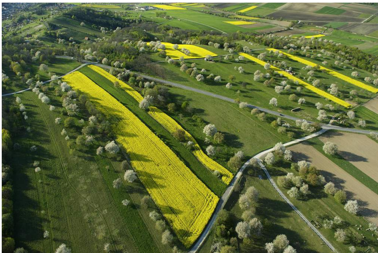
Figure 2: Rural Resilience: A glimpse into Green Infrastructure in rural landscapes, where nature and sustainable management harmonise to enhance environmental health and community well-being.

Green Infrastructure (GI) refers to a network of interconnected natural and semi-natural features that provide a wide array of ecosystem services. These services encompass functions such as water purification, air quality improvement, habitat provision, climate regulation, and opportunities for recreation. The core concept revolves around the strategic incorporation of these natural elements into land use planning and development, recognizing their role in maintaining ecological balance and promoting human well-being. In the Alpine context, GI encompasses the diverse components of the natural environment, blending seamlessly with the cultural and urban fabric of the region.