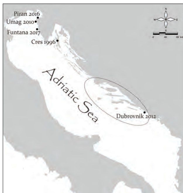
Fig. 1: Records of Calappa granulata in the Adriatic Sea: Piran 2016 and Funtana 2017 (the present work), Umag 2010 (Dulčić & Tutman, 2012), Cres 1996 and Dubrovnik 2012 are referred to specimens deposited in the Natural History Museum of Rijeka; the circle shows the geographic area indicated by Stossich (1880) and Štević (1990).

The shamefaced crab Calappa granulata (Linnaeus, 1758) is a sublittoral species known from the Mediterranean Sea and adjacent Atlantic Ocean from Portugal to Mauritania, including the Azores, Madeira, the Canary Islands and the Cape Verde Islands (Manning & Holthuis, 1981; Štević, 1990). More recent records in the Mediterranean Sea are the Gulf of Taranto (Ionian Sea) (Pastore, 1995), the Strait of Sicily (Spanò et al. , 2004), the coastal waters of the Sea of Marmara (Artüz, 2006) and Edremit Bay (Aegean Sea) (Balkis & Kurun, 2008). In the Adriatic Sea, Stossich (1880) mentioned this species as rare in Split, Hvar, Vis and Korčula. After 110 years Štević (1990) confirmed the rarity of this crab in the Middle and South Adriatic where it was recorded in waters off Šibenik, Split, Dubrovnik, Sestrunje, Hvar, Korčula and Vis. The last records from the southern Adriatic arises to Ungaro et al. (2005) who found some