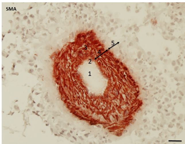
Fig. 2. Immunohistochemical staining of smooth muscle actin (SMA) in an arteriole in a glioblastoma tissue section. SMA is localized in smooth muscle cells (dark red). 1 = lumen of the arteriole, 2 = endothelial cell, 3 = smooth muscle cell, 4 = tunica media, 5 = tunica adventitia. Bar = 20 \mu m.

long as vascular is not taken for capillary [31].