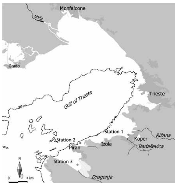
Fig. 1. A map of the Gulf of Trieste with stations included in the biomonitoring programme with geographical coordinates: Station 1: 13^{\circ} 43,36' N , 45^{\circ} 33,00' E ; Station 2: 13^{\circ} 35,40' N , 45^{\circ} 31,93' E ; Station 3: 13^{\circ} 35,00' N , 45^{\circ} 29,40' E

from local agriculture. The impact of this inflow is significant after a rainy period; otherwise the stream flow is quite small. Station 2 is 11.4 km away from Station 1, and 9.2 km away from Station 3. The content of Cd in the sediment was in the range from 0.155 mg/kg to 0.112 mg/kg, and in the sea water was from 2.3 \mu\text{g/L} to <0.1 \mu\text{g/L} . Moreover, the level of Hg in the sediment was in the range from 0.533 mg/kg to 0.15 mg/kg, and in the sea water from 0.4 \mu\text{g/L} to 0,00109 \mu\text{g/L} (ARSO, 2010).