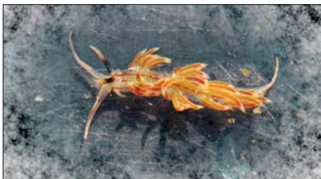
Fig. 5: A specimen of Facelina rubrovittata found in the intertidal zone of Mesečev zaliv within the marine protected area of Strunjan.

Sl. 5: Primerek vrste Facelina rubrovittata , najden v bibavičnem pasu v Mesečevem zalivu znotraj Naravnega rezervata Strunjan