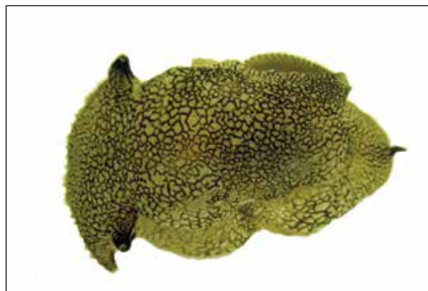
Fig. 2: A specimen of Pleurobranchaea meckelii caught in the Gulf of Piran by a dredge on the detritic coastal bottom in June 2014.

Legend / Legenda: ☆ - Pleurobranchaea meckelii , ○ - Facellina rubrovittata , □ - Favorinus branchialis , △ - Dondice banyulensis