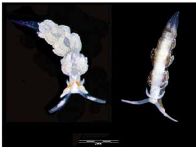
Fig. 3: A specimen of Favorinus branchialis found on turf in May 2014 in Koper harbour. Sl. 3: Primerek vrste Favorinus branchialis, najden na turfu v maju 2014 v koprskem pristanišču

F. rubrovittata has been already recorded in the western Mediterranean, off the Atlantic coast of Spain