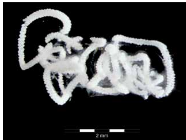
Fig. 4: Spawn of Favorinus branchialis found on turf at 1 m depth in the harbour of Koper. Sl. 4: Leglo vrste Favorinus branchialis , najdeno na turfu v maju 2014 v koprskem pristanišču