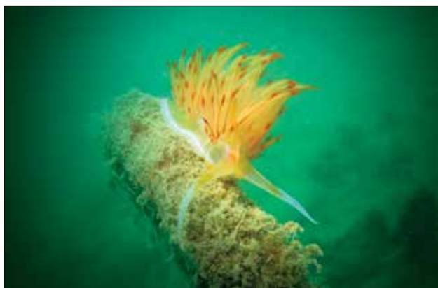
Fig. 6: A specimen of Dondice banyulensis on a polychaete Spirographis spallanzani on the bottom of the Debeli rtič Nature Monument on 9 th September 2014.

Single specimen, aquatory in front of the lighthouse, Nature Monument Debeli rtič, 9 th September 2014, depth 10 m, sedimentary detritic bottom. Specimen is stored in the collection at MBS.