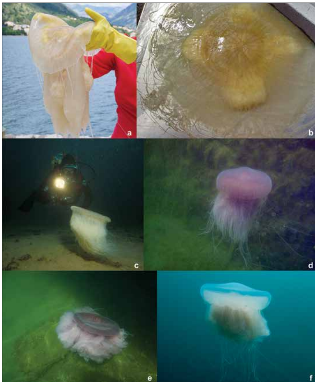
Fig. 2a: D. dalmatinum collected on 2 June 2014 in Boka Kotorska, bell diameter 35 cm.

Sl. 2a: Dalmatinska lasasta meduza, ulovljena 2. 6. 2014 v Boki Kotorski, premer klobuka 35 cm