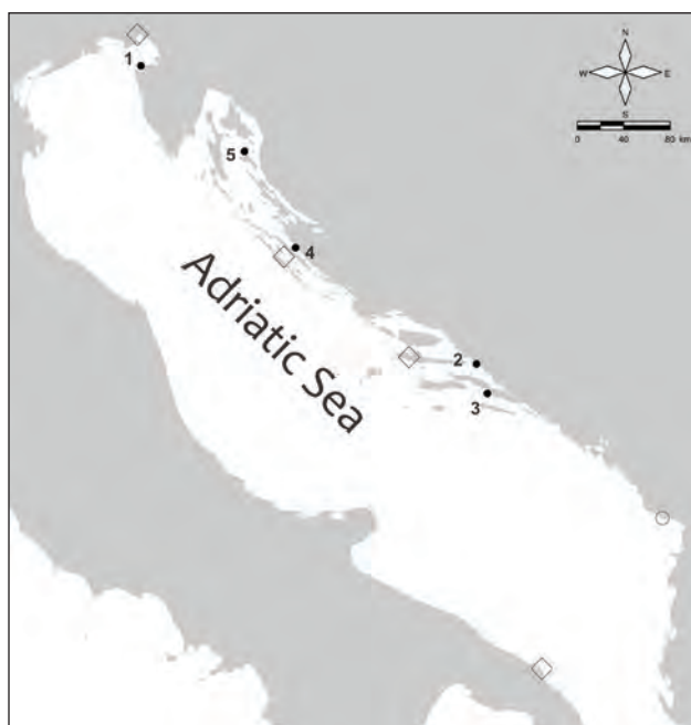
Fig. 1: Map of the Adriatic Sea with localities where meagre specimens were caught (black dots; numbers represent the following localities: 1- Piran, 2 – Brist, 3 – Pelješac, 4 – Zadar, 5 – Rab), with localities (Apuglia, Monfalcone, Hvar, Zadar) where the meagre is cultivated (squares) and the area (Bojana river mouth) where the last known natural population still occurs (circle).

The meagre, Argyrosomus regius (Asso, 1801), is a demersal, oceanodromus, ray-finned fish of the family Sciaenidae. It is a large top-predator, with a high trophic level (4.3) that consumes large sized and heavy preys. It feeds on a wide range of crustaceans and fish (Valero-Rodriguez et al. , 2015). Adults inhabit inshore and shelf waters while juveniles and subadults prefer estuaries and coastal lagoons. It mostly occurs over sandy bottoms, close to rocks, at depths from 1 - 200 m (Louisy, 2002). Original distribution of the meagre is the eastern Atlantic, from Norway to Gibraltar and Congo, including the Mediterranean and the Black Sea (Griffiths & Heemstra, 1995). It also migrated via Suez Canal to the Red Sea as an anti-Lessepian migrant (Chao & Trewavas 1990).