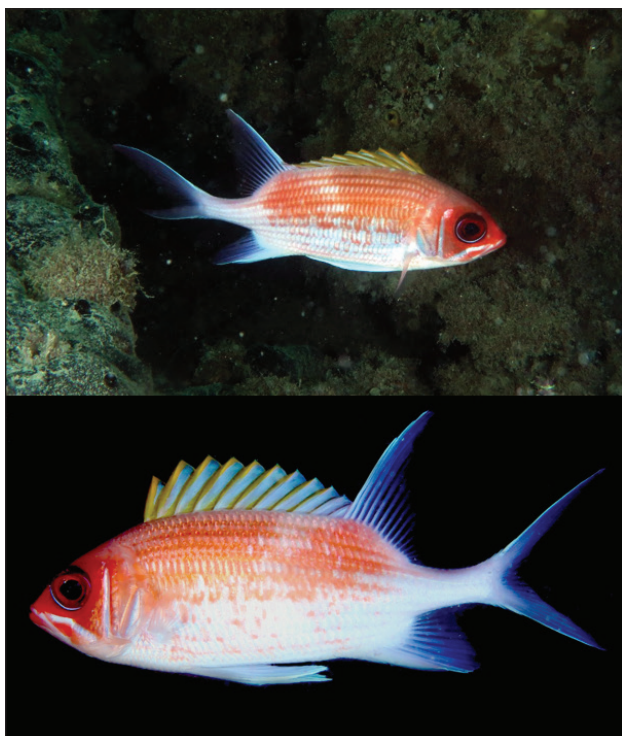
Fig. 2: A specimen of long-jawed squirrelfish Holocentrus adscensionis , photographed in the marine protected area of WWF Miramare near Trieste on August 16, 2022. Sl. 2: Primerek vrste veveričjaka Holocentrus adscensionis , fotografiran 16. avgusta 2022 v zavarovanem območju WWF Miramare.

tion. On the following day, they tried to capture the specimen with a hand net. Unfortunately, the specimen eluded capture and the next day, despite intense effort, the researchers were no longer able to spot it.