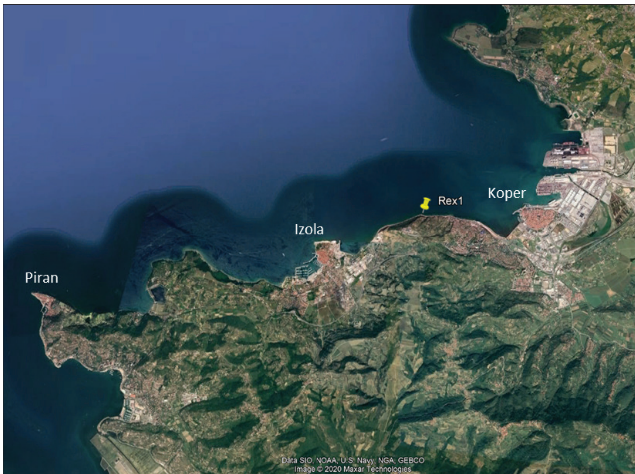
Fig. 1: Sampling site Rex1 between Koper and Izola, where three thalli of Cystoseira foeniculacea f. latiramosa were recorded. Sl. 1: Vzorčno mesto Rex 1 med Koprom in Izolo, kjer so bile opažene tri steljke vrste Cystoseira foeniculacea f. latiramosa .

Especially in the past two decades, many scientists have evaluated the impact of interacting anthropogenic local stressors on coastal ecosystems (Airoldi & Bulleri, 2011; Catra et al. , 2019). The disappearance of Cystoseira s.l. species from shallow rocky bottoms is considered an indication of severe environmental degradation (Iveša et al. , 2016; Rindi et al. , 2018). Due to incessant anthropogenic pressure, Cystoseira s.l. spp. are very often replaced by smaller and less complex algae defined as turf-forming taxa (Perkol-Finkel & Airoldi, 2010). These low-lying algae form a permanent stable state on the bottom, which inhibits the recolonization by canopy-forming species (Gorman et al. , 2009; Connell et al. , 2014). Some Cystoseira s.l. species have already been driven to regional extinction (Thibaut et al. , 2015), and despite the implementation of substantial conservation measures, numerous degraded brown algal forests in the Mediterranean Sea have not recovered (Thibaut et al. , 2005; Perkol-Finkel & Airoldi, 2010).