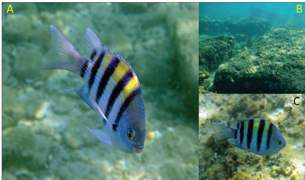
Fig. 1: A specimen of Sergeant Major Abudefduf saxatilis at Punta Sottile (near Trieste) (A and C) at the end of August 2019 in a reef-like habitat, made of sandstone boulders, covered mainly with turf (B). Sl. 1: Primerek velikega seržanta, Abudefduf saxatilis opaženega blizu Tankega rtiča (pri Trstu) (A in C) na koncu avgusta 2019 v grebenastem okolju iz peščenjakovih plošč, poraslih z nizko blazinasto vegetacijo (B).

The specimen was identified as a pomacentrid species of the genus Abudefduf due to an oval compressed body, typical colour pattern with light and five blue-black