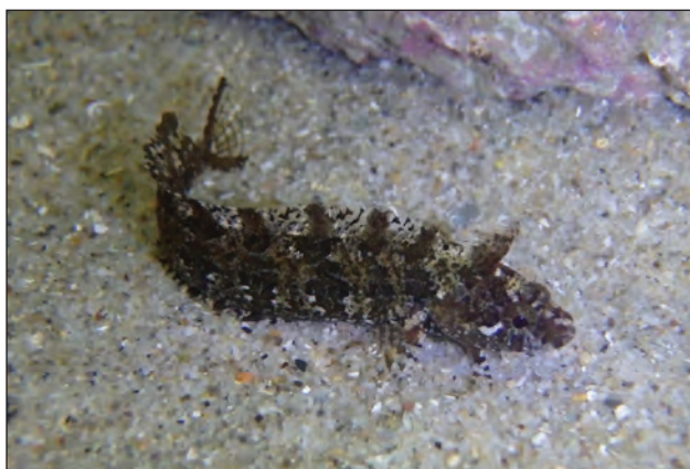
Fig. 1: A specimen of Clinitrachus argentatus found in Slovenian coastal waters.

The data regarding the occurrence of C. argentatus in the Adriatic Sea are scarce, limited and sporadic. Patzner (1985) reported the finding of two specimens