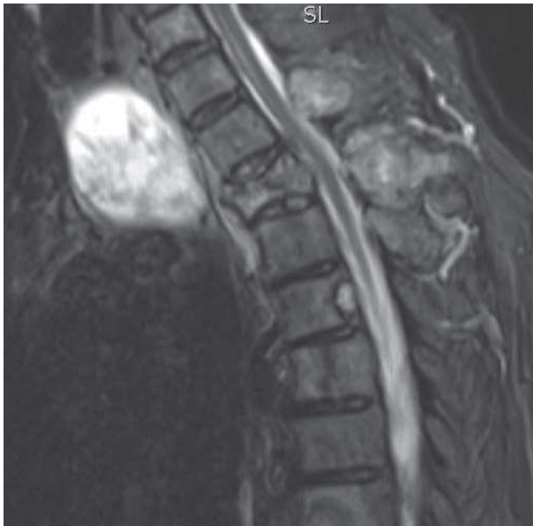
FIGURE 1. A 75-year-old patient was operated on after preparation with thiamazole for a pathological fracture of Th2. Spinal stabilization was performed.