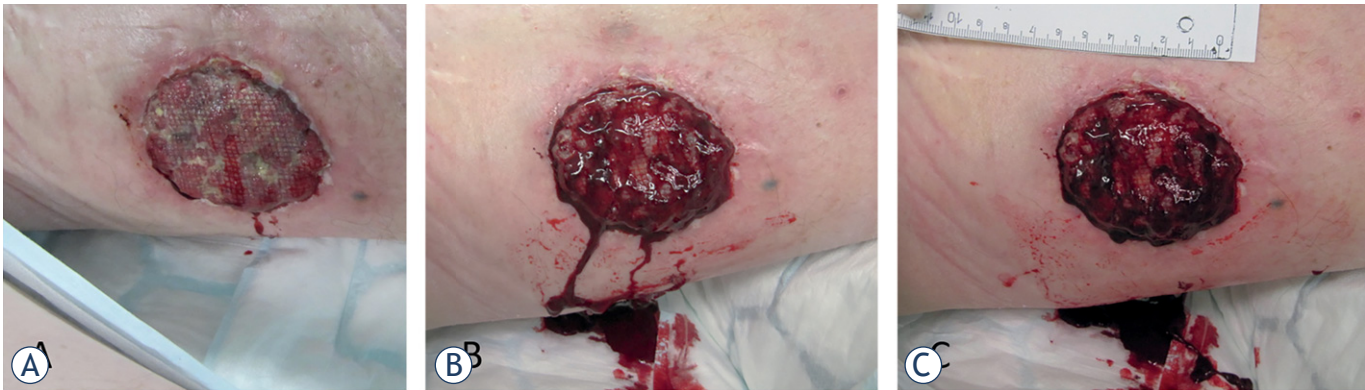
FIGURE 1. Treatment of vascularized melanoma metastasis by electrochemotherapy. (A) Highly vascularized tumor before treatment. (B) Bleeding due to electrode insertion after application of electric pulses to the tumor. (C) Bleeding stopped immediately after electric pulse application.