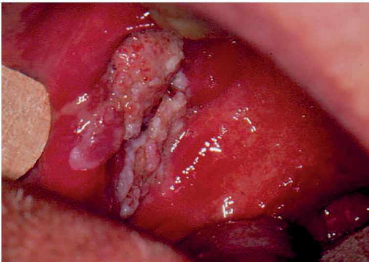
FIGURE 1. Verrucous carcinoma of the right buccal mucosa (clinical stage T2N0M0) in an 81-year-old male patient. He presented with a whitish exophytic tumour mass of the inner side of the right cheek and without suspicious lymph nodes on the neck. The lesion was noticed by the patient a month before initial examination, and it occasionally hurt, but he had no problems feeding. Due to associated diseases, he was treated with radiotherapy (55 Gy, 2.2 Gy/fraction) and concurrent intravenous chemotherapy (vinblastine 2 mg, day 1; methotrexate 50 mg, day 2; bleomycin 15 mg, days 2 and 3). The patient died of injury 5.5 years after completion of treatment for verrucous carcinoma with no evidence of malignant disease in oral cavity.

Initial reports of neck metastasis in verrucous carcinoma were later attributed to incorrect pathologic diagnosis or to a presence of foci of conventional SCC of varying degree of differentiation within a verrucous carcinoma. The so-called hybrid verrucous carcinoma was first described by Batsakis et al. in 1982 in three verrucous lesions of the larynx. 29 Medina et al. later reported coexistence of verrucous carcinoma and conventional SCC in 20% of 104 patients with oral verrucous carcinoma. 30 In contrast to the classic, histologically uniform verrucous carcinoma, a hybrid verrucous carcinoma is capable of metastasizing and must therefore be managed as a more common and aggressive conventional SCC. 31 However, it is not possible to differentiate these lesions at clinical examination due to similar appearance. Moreover, examination of small tumour samples obtained with biopsy could be misleading as an invasive component is often missed at sampling. 32 Gokavarapu et al. reported that 51% of cases preoperatively diagnosed as oral