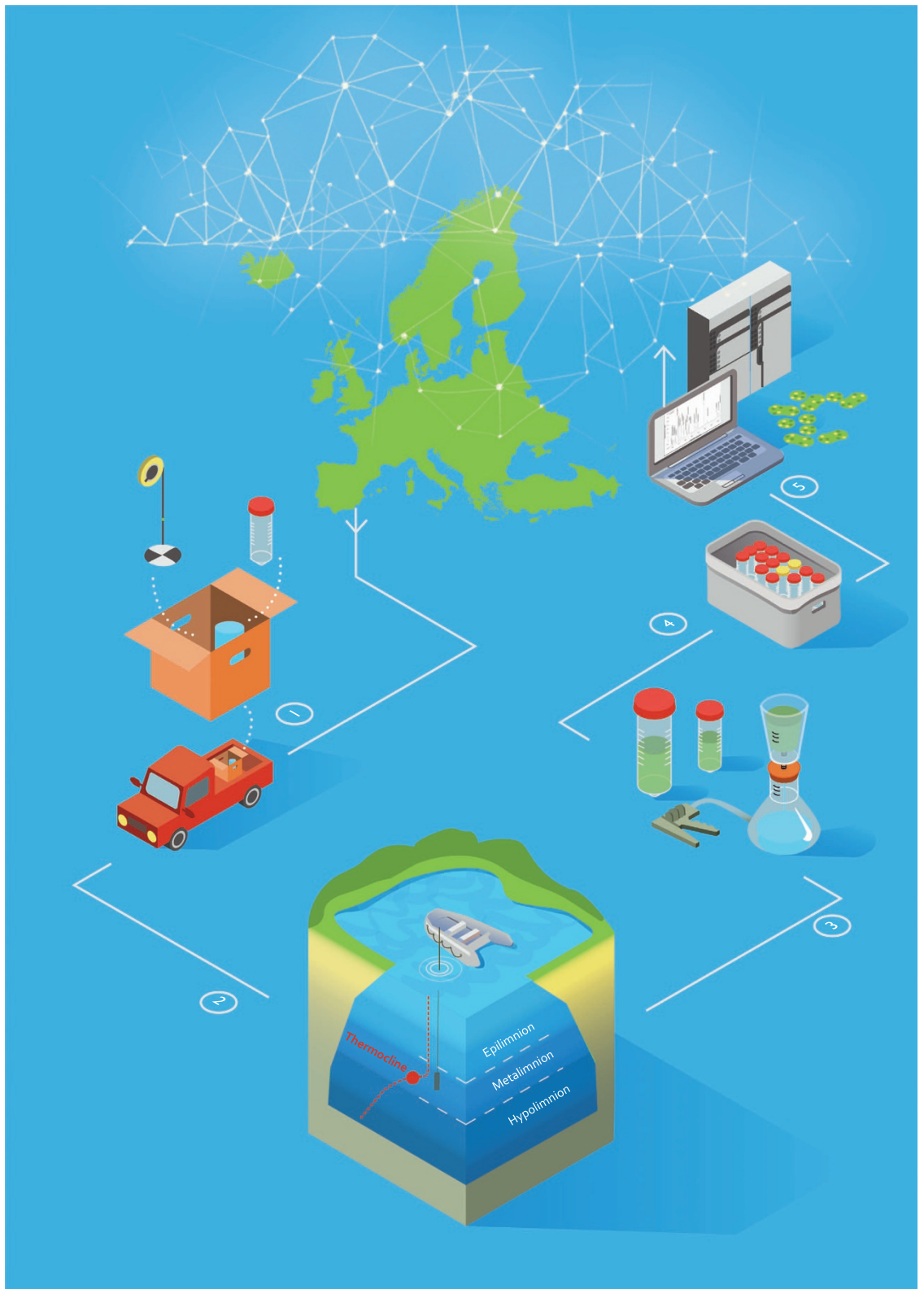
Figure 2. Schematic overview of the European Multi Lake Survey (EMLS). CyanoCOST and NETLAKE members performed the sampling routine by: 1. Preparing the sampling material to meet the standardized procedures 2. Accessing the lake site and acquiring integrated water samples from the bottom of the thermocline up to the water surface 3. Processing and preserving the water samples based on requirements for subsequent analysis 4. Shipping samples to a central receiving laboratory 5. Analysing nutrient, pigment and toxin concentrations in dedicated laboratories. After quality control checks and data integration the dataset returns to the European network and becomes publically available for further research. Created by Sarah O’Leary and Eilish Beirne.