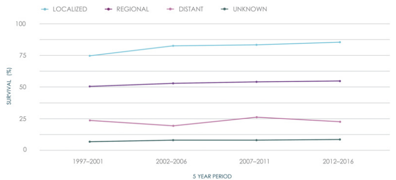
FIGURE 3. Five-year net survival of patients with cancer (all solid tumours but non-melanoma skin cancer) by stage at diagnosis, Slovenia 1997-2016.

disease remains the same. This is partly due to more accurate and accessible diagnostic methods that allow detecting more and smaller distant lesions despite on a whole the diagnostic is done earlier.