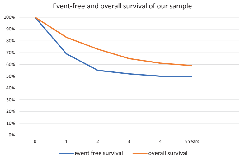
FIGURE 3. Event-free (EFS) and overall survival (OS) of investigated sample.

43.0–58.0%) (Figure 3). At median follow up of 5 years 106 patients were alive, 69 dead due to disease relapse or progression and 3 from toxic death. Patients with bladder/prostate (92%), orbit (72%) and para-testicular (81%) primary had highest OS and those with thoracic primary poorest outcome (40%). Survival in patients with head and neck (54%), para-meningeal (55%), extremity (47%), abdominal and pelvic primaries (48%) was around 50%.