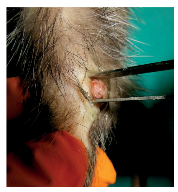
FIGURE 7. Electric pulses were delivered to the squamous papilloma (Tumour 4) using plate electordes.