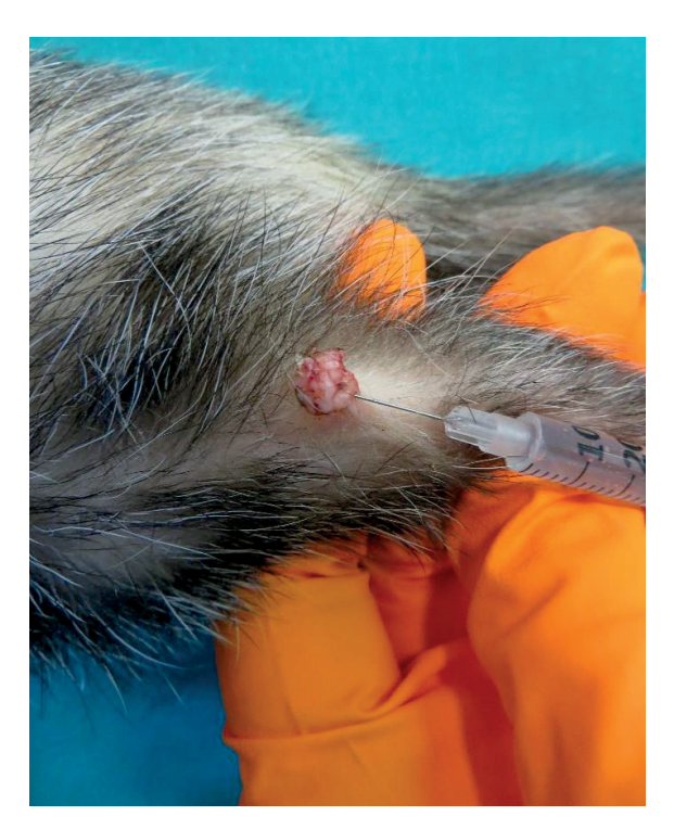
FIGURE 5. Intralessional injection of bleomycin into squamous papilloma (Tumour 4).