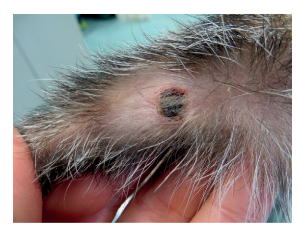
FIGURE 8. Necrosis with superficial scab of squamous papilloma (Tumour 4) 8 days after electrochemotherapy.

the MCT located on the laterodorsal tail base became necrotic on day 6 and a complete response (CR) was seen approximately 1 month after ECT, while the second MCT found on the lateral side of the right hock became necrotic on day 15 and CR was seen approximately two months (67 days) after ECT (Figure 9). In second patient, both tumours became necrotic on day 8 (Figure 8) and CRs were seen 70 days after ECT (Figure 10). In first patient, no tumour growth has been seen during the observation period of 15 months after ECT of the tumour located on the tail base, and 11 months after ECT of the tumour located on the right hock. In second patient, no tumour recurrence was detected 8 months after treatment.