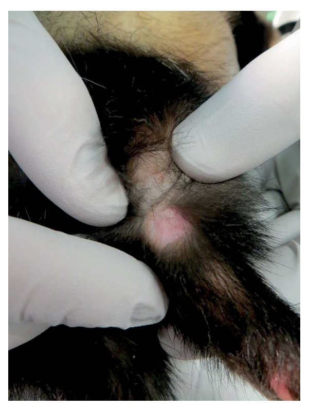
FIGURE 9. Complete response of mast cell tumour (Tumour 2) - 67 days after electrochemotherapy.

ECT with bleomycin as a single treatment was an effective treatment of cutaneous neoplasms; MCTs, sebaceous adenoma, and squamous papilloma in our cases. ECT was well tolerated by the patients and is a minimally invasive procedure with no major side effects noted, with excellent responses and long-lasting CR. In first patient, no tumour growth was seen during observation period of 15 months after ECT of the tumour located on the tail base, and 11 months after ECT of the tumour located on the right hock. In second patient, no tumour regrowth was seen 8 months after treatment. Different studies reported an excellent treatment response of ECT with cisplatin or bleomycin in tumours of different histology with minimal side effects in dogs<sup>10,11</sup>, cats<sup>12</sup>, horses<sup>13</sup>, pet rats<sup>14</sup>, and reptiles<sup>15,16</sup>. In our cases, only some muscle contractions of the