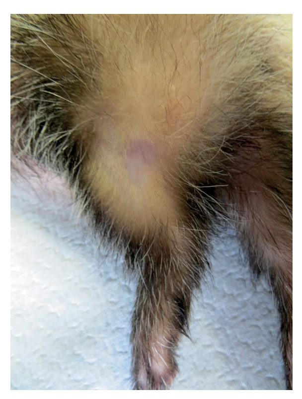
FIGURE 10. Complete response of squamous papilloma (Tumour 4) - 70 days after electrochemotherapy.

ti-tumour effectiveness, combined with excellent functional and cosmetic effects, while being less invasive than surgery.<sup>8,10,11,12</sup>