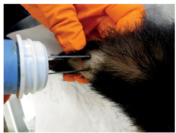
FIGURE 6. Electric pulses were delivered to the mast cell tumour (Tumour 2) using plate electordes.

electrodes (distance between the electrodes: 6 mm) (Figures 6,7). Good contact between the electrodes and tumour mass was obtained by application of conductive gel to the treatment area. Electric pulses were generated by the electric pulse generator (Cliniporator<sup>TM</sup> - IGEA srl, Carpi [MO], Italy). The entire tumour was exposed to electric pulses by moving the electrodes perpendicular through the whole volume of mass and the surrounding skin, starting on the tumour periphery. The duration of each ECT cycle was approximately 15 minutes, and in both cases, the recovery from anaesthesia was uneventful. Meloxicam (Loxicom; Norbrook Laboratories) in a dose 0.2 mg/kg/day9 was prescribed for 3 consecutive days orally after every cycle of ECT to reduce pain and inflammation.