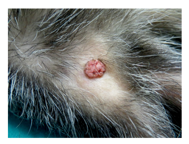
FIGURE 1. Macroscopic presentation of squamous papilloma (Tumour 4).

body. They are firm, warty and often multinodular, sometimes looking very similar to MCTs. They can be ulcerated, irritated and traumatised with local inflammation.<sup>2,4</sup>