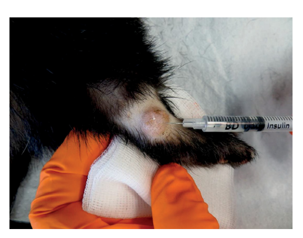
FIGURE 4. Intralessional injection of bleomycin into mast cell tumour (Tumour 2) located laterally on the right hock. Note the size of tumor and surgically chalenging anatomical location.

tumour composed of round cells that exhibited mild anisocytosis. Neoplastic cells had a moderate amount of pale blue cytoplasm and round nuclei that exhibited mild anisokaryosis. Additional Toluidine blue staining revealed numerous cytoplasmic metachromatic granules. Mitotic figures were rare.