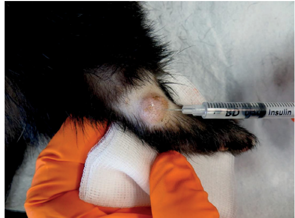
FIGURE 4. Intralesional injection of bleomycin into mast cell tumour (Tumour 2) located laterally on the right hock. Note the size of tumor and surgically challenging anatomical location.

In the first patient, both masses were diagnosed as MCTs, and in the second patient, squamous papilloma of hock region and sebaceous adenoma of chest region were diagnosed. Haematology,