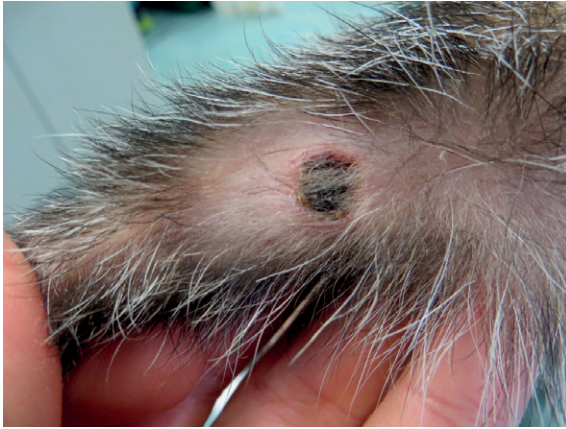
FIGURE 8. Necrosis with superficial scab of squamous papilloma (Tumour 4) 8 days after electrochemotherapy.

the MCT located on the laterodorsal tail base became necrotic on day 6 and a complete response (CR) was seen approximately 1 month after ECT, while the second MCT found on the lateral side of the right hock became necrotic on day 15 and CR was seen approximately two months (67 days) after ECT (Figure 9). In second patient, both tumours became necrotic on day 8 (Figure 8) and CRs were seen 70 days after ECT (Figure 10). In first patient, no tumour growth has been seen during the observation period of 15 months after ECT of the tumour located on the tail base, and 11 months after ECT of the tumour located on the right hock. In second patient, no tumour recurrence was detected 8 months after treatment.