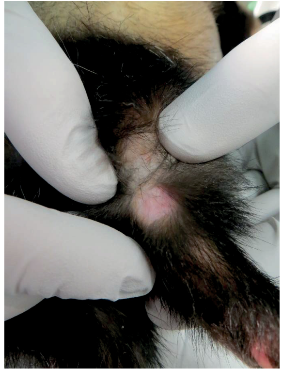
FIGURE 9. Complete response of mast cell tumour (Tumour 2) - 67 days after electrochemotherapy.

ECT with bleomycin as a single treatment was an effective treatment of cutaneous neoplasms; MCTs, sebaceous adenoma, and squamous papilloma in our cases. ECT was well tolerated by the patients and is a minimally invasive procedure with no major side effects noted, with excellent responses and long-lasting CR. In first patient, no tumour growth was seen during observation period of 15 months after ECT of the tumour located on the tail base, and 11 months after ECT of the tumour located on the right hock. In second patient, no tumour regrowth was seen 8 months after treatment. Different studies reported an excellent treatment response of ECT with cisplatin or bleomycin in tumours of different histology with minimal side effects in dogs 10,11 , cats 12 , horses 13 , pet rats 14 , and reptiles 15,16 . In our cases, only some muscle contractions of the