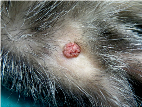
FIGURE 1. Macroscopic presentation of squamous papilloma (Tumour 4).

body. They are firm, warty and often multinodular, sometimes looking very similar to MCTs. They can be ulcerated, irritated and traumatised with local inflammation. 2,4