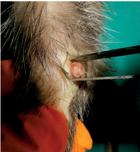
FIGURE 7. Electric pulses were delivered to the squamous papilloma (Tumour 4) using plate electrodes.