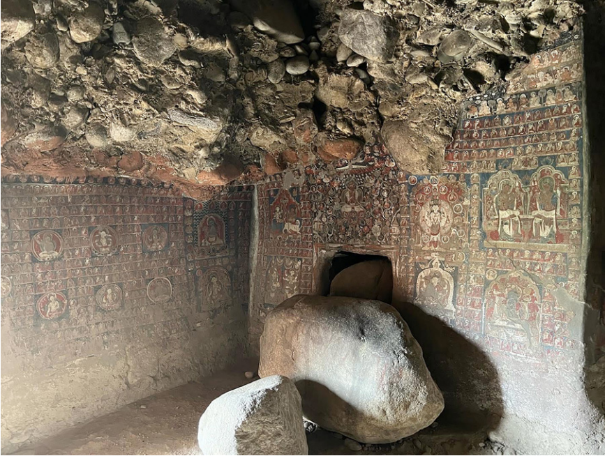
Figure 4: Meditation cave in Saspol; Ladakh, India

prior to examining the soteriological technique of dreaming, a concise overview will be provided for the two preceding practices: inner mystic heat ( gtum mo ) and illusory body ( sgyu lus ).