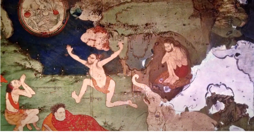
Figure 7: Yogi jumps and screams: “This is a dream, this is a dream!”; mural in the secret temple of Lukhang, Tibet, 17th century (Wikimedia Commons, public domain)

ed towards their teacher and the Buddha. Following this, within the throat cakra region, they can visualize sharp blades slicing their body into fragments. Subsequently, in their mind, they offer these pieces as a sacrifice to the Buddha and all sentient beings. This is followed by the mahāmudrā practice.