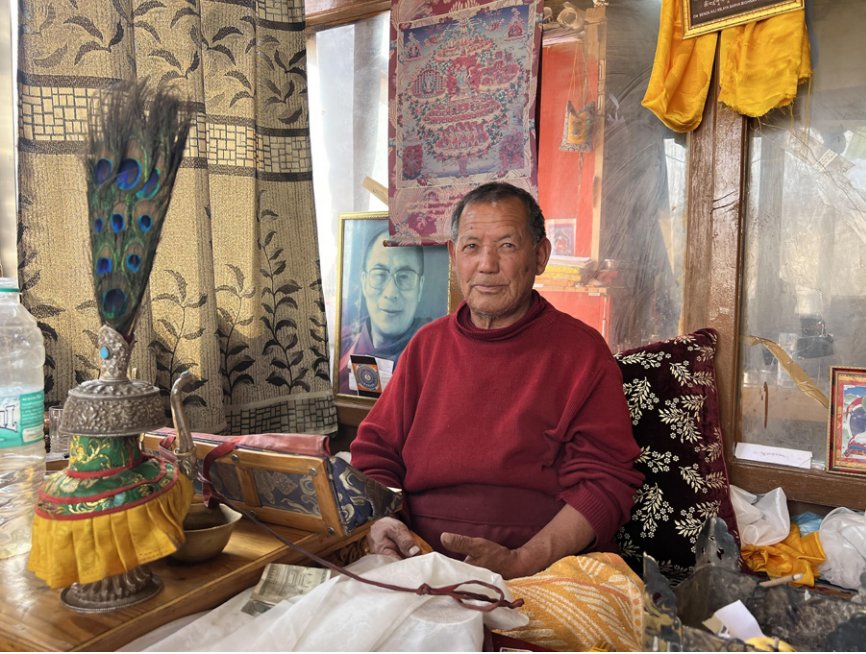
Figure 2: Yogi in his hut up in the Himalayan mountains near the Sakti village; Ladakh, India

tricate psychophysical methods, they have earned the moniker of “madmen” (Tib. smyon pa ). 8 From its inception to the contemporary era, the lineage of autonomous Buddhist Tantric yogis 9 has forged its distinct trajectory, transcending societal and monastic hierarchies. This spirit of independence is also mirrored in their spiritual pursuits, which differ from those of monks and nuns constrained by institutional structures and rigid curricula. The endeavours of Tantric yogis are marked by crea-