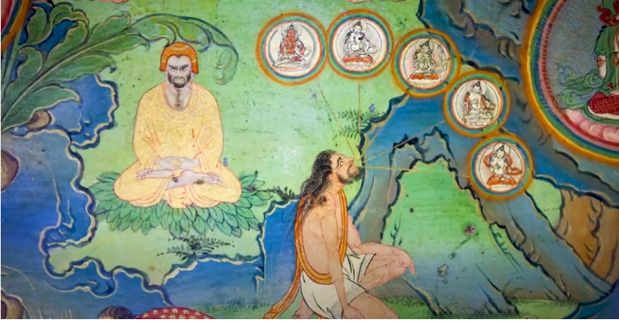
Figure 5: Visualisation of Buddhist deities, a mural in the secret temple of Lukhang, Tibet, 17th century

firmation, marking the true commencement of the disciple's spiritual journey.