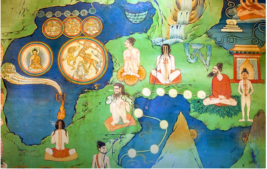
Figure 6: Yogis practising various meditation techniques; Milarepa (bottom left) practising gtu mo and the transference of consciousness; mural in the secret temple of Lukhang, Tibet, 17th century

tions to these mental images and giving rise to a generation of inner warmth. The method of invigorating energy and warmth circulation within the body facilitates a revitalization of its latent potentials, concurrently serving to neutralize adverse karmic imprints like animosity, instincts, physical cravings and attachments. This paves the way for the emergence of a sensation of joy and compassion towards all sentient beings (Skt. karuṇā , Tib. snying rje ). Consequently, the outcome of the inner mystic heat technique is also referred to as the experience of blissful warmth (Tib. bde drod ). As per various sources, once the yogi attains complete mastery over the practice, they encounter shimmering effects before their eyes. Visions encompass smoke, flames, unclouded skies, radiant sun and moon beams, the harmonious convergence of the sun and moon, and even rainbows. 24 Following a fruitful technique session,