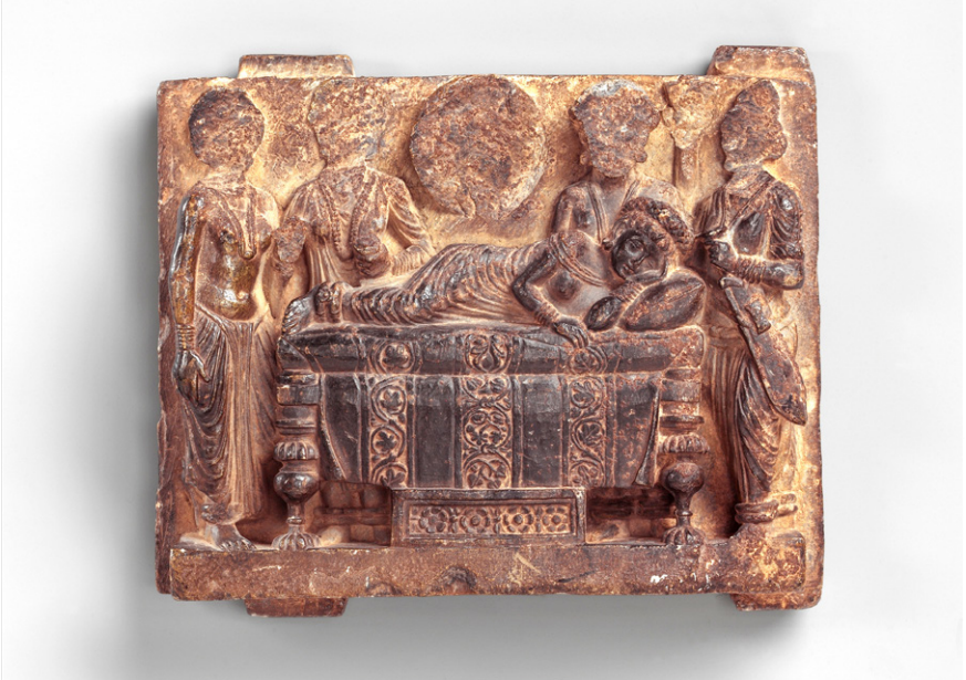
Figure 1: The Dream of Queen Maya (the Buddha's Conception); Pakistan (ancient region of Gandhara), c. 2nd century

served as an integral link in his quest for and attainment of the highest philosophical insights.