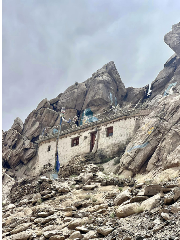
Figure 3: Hermitage, where Ladakhi yogis practice various meditation techniques; the Leh area, Ladakh, India

( prāṇāyāma ), guru-dedicated prayers, visualizations and a spectrum of psychophysical methods are integral. These techniques find their origins in the Hindu Tantric tradition and bear relation to the practices of hathayoga . The practices undertaken by yogis and yoginīs in solitude, following rigorous preliminary techniques and guided by their teachers, are structured hierarchically. This signifies that mastery of each successive technique is contingent upon complete proficiency in the preceding one. Furthermore, familiarity with the other practices becomes indispensable for a comprehensive grasp of a particular technique. Thus,