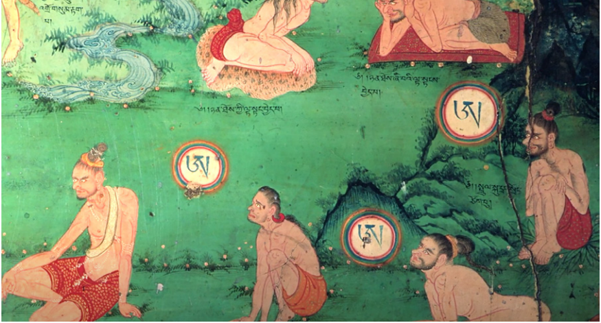
Figure 12: Visualisation of sacred syllables; mural in the secret temple of Lukhang, Tibet, 17th century

tertwined with light, signifying the fusion of consciousness with the utmost state. Gampopa's commentaries also allude to a technique reminiscent of Hindu haṭhayoga , as evident from its meaning, i.e. "strong, forceful transference" (Tib. btsan thabs kyi 'pho ba ). The Tibetan term btsan thabs corresponds to the Sanskrit term haṭha , signifying "power" and "force". Yogis can also engage in these practices with a dying person. There have also been techniques involving the visualization of consciousness transfer to another body within one of the samsāric realms. These methods are primarily employed by those who are less adept and may not achieve Buddhahood upon death. However, mastery of the six yogas leads to the unconditioned state, rendering such practices unnecessary. Fragments of Tilopa's teaching also describe the practice of entering a new body after death, whereby yogis direct their consciousness from their body into another body (Tilopa, [ 'pho ba 61]). This practice of transference can be undertaken during one's lifetime by directing consciousness towards a recently deceased individual, whose body is still in a fresh state.