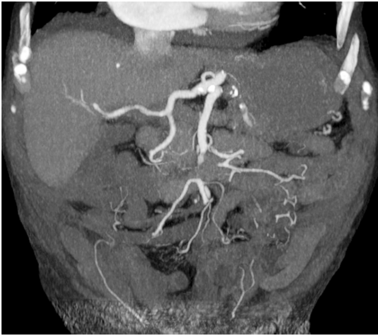
FIGURE 1. Coronal MIP reconstructions of CTA, revealing a segmental, occlusive acute embolism of the mid portion of SMA stem.