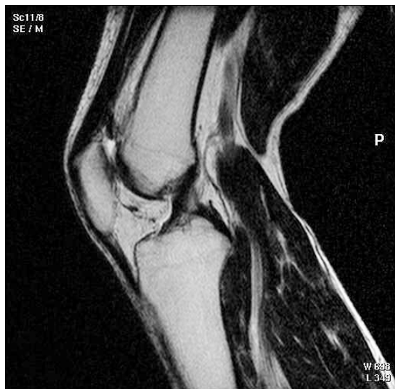
FIGURE 4. Anterior cruciate ligament (ACL) flexion MRI technique.

All patients suffered from a knee injury which mechanism pointed to the lesion of internal soft tissue structures and thus potentially to the ACL injury. The anterior drawer test was positive in 94 patients (63.1%), out of them 86 (57.7% of total patients) had positive Lachman test. In the remaining 55 (36.9%) patients, MR examination was performed on the basis of the mechanism of injury (from patient's history) and clinical suspicion of a violation of the ACL.