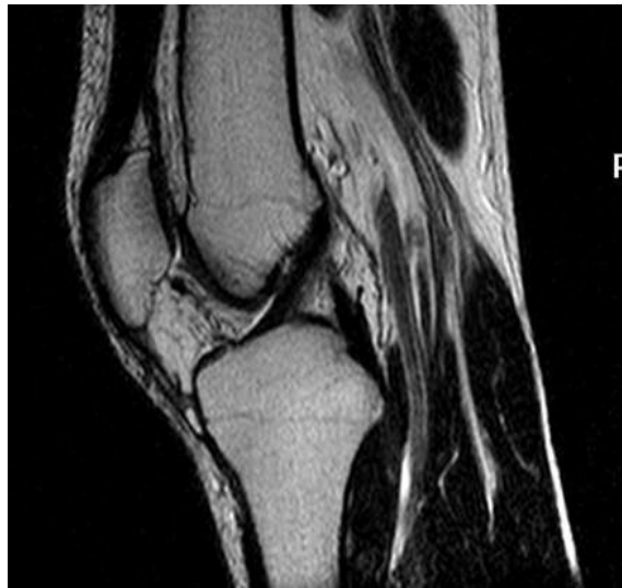
FIGURE 3. Anterior cruciate ligament (ACL) sagittal-oblique T2 FSE image.

All 149 patients (108 males, 41 females) were sent to MRI examination with a clinical diagnosis: internal knee lesion-meniscal or ACL lesion. In 59 patients (39.6%) referring diagnosis was decisive – ACL lesion.