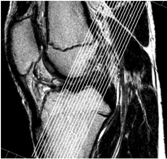
FIGURE 1. Sagittal image of standard MRI examination as a topogram for planning the paracoronal oblique T2 FSE 2 mm image.