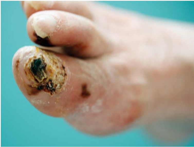
FIGURE 1. Ischemic necrosis on digits I and II of right foot after 4 cycles of chemotherapy with cisplatin and gemcitabine (Case 2).

reversible posterior leukoencephalopathy are reported. 1